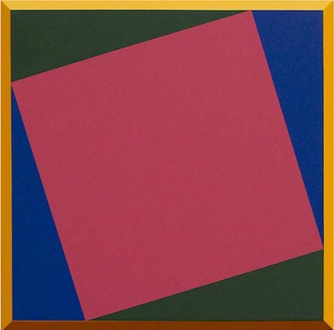
Ronald Davis Raspberry Square Twist Bevel, 2010 Acrylic on expanded PVC 20 x 20 x 3 inches ROND0021