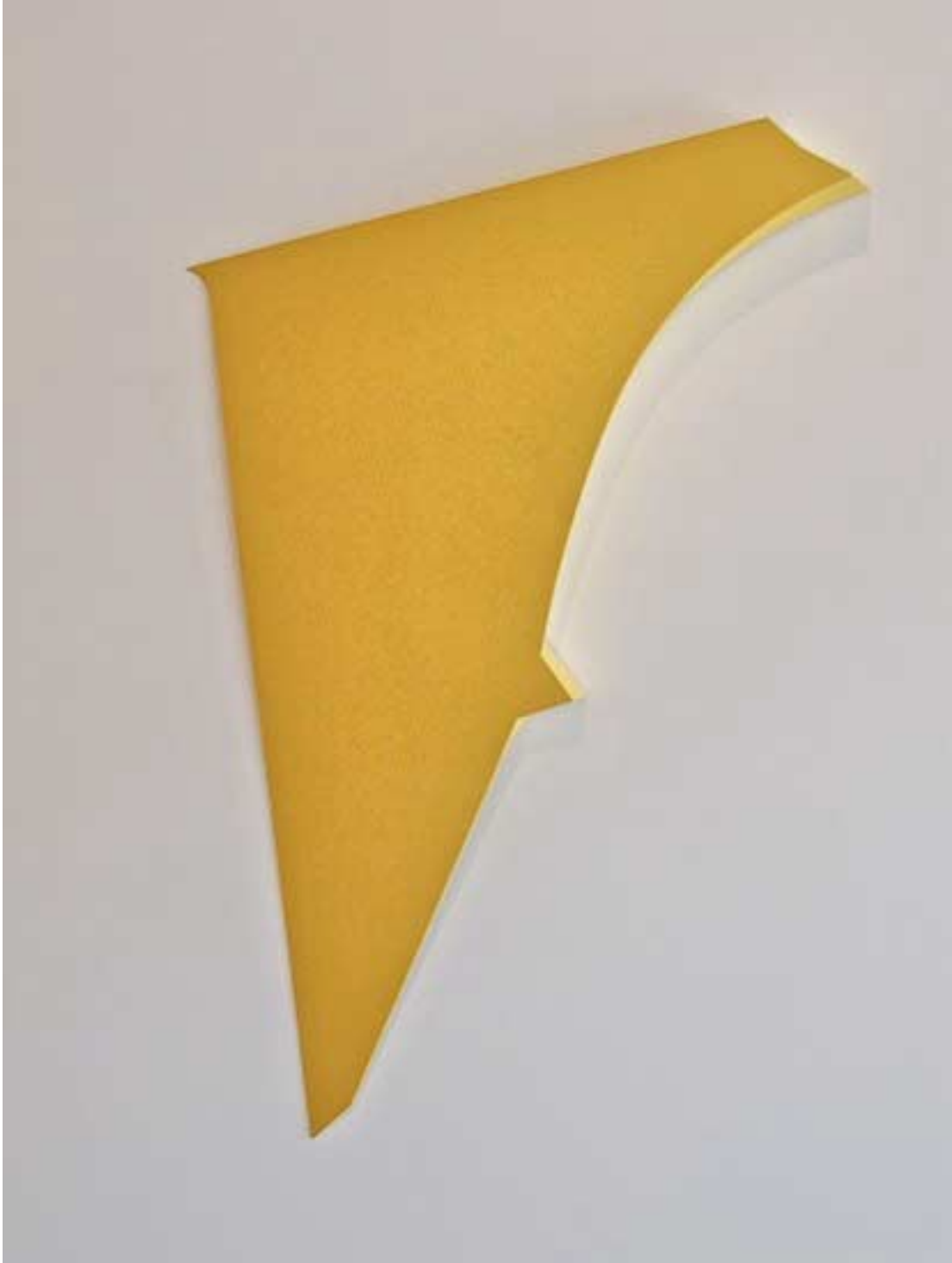
Tony DeLap Zinger II, 2003 acrylic on aluminum, wood 46 1/2 x 33 1/2 x 3 inches TD002