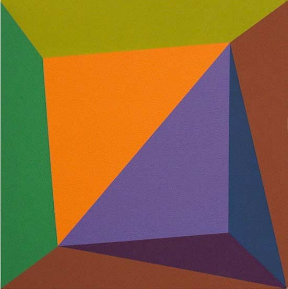
Ronald Davis Tetra Un-Square, 2009 Acrylic on expanded PVC 20 x 20 x 2 1/2 inches ROND075