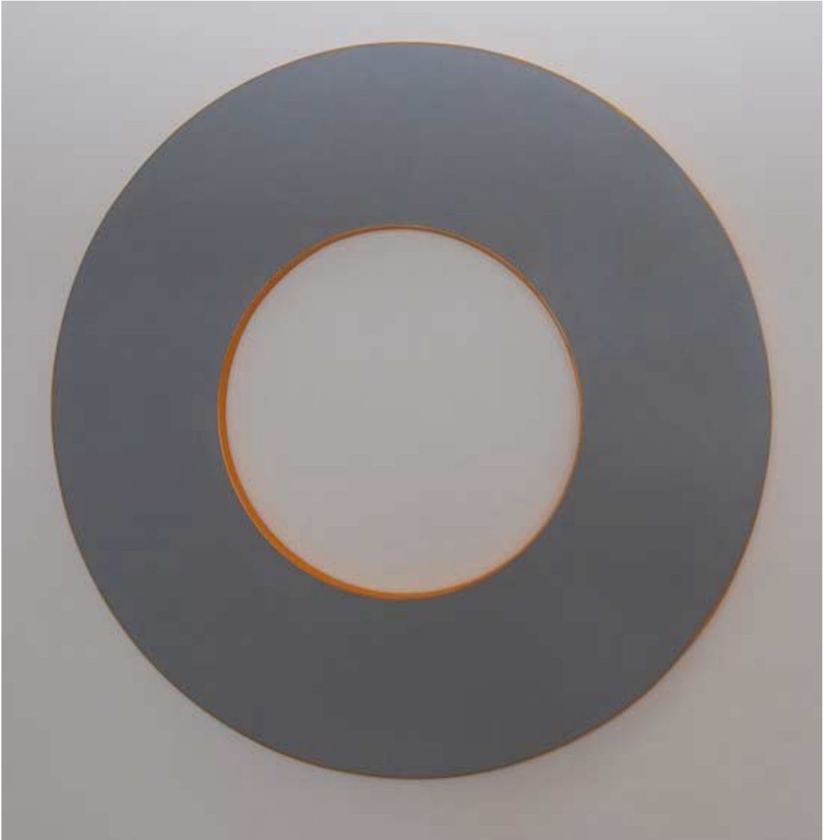
Elliot Norquist Boost Dose, 2012 painted steel 40 x 40 x 1 1/8 inches EN0072