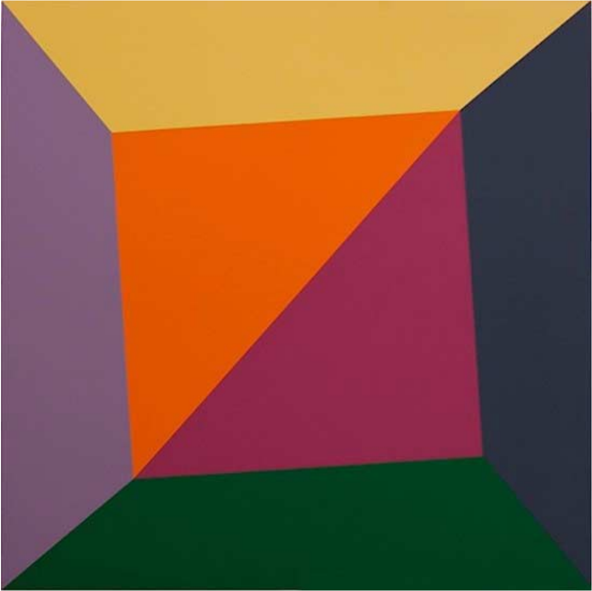
Ronald Davis Large Diagonal Twist, 2010 Acrylic on expanded PVC 39 3/4 x 40 x 2 1/2 inches ROND0043