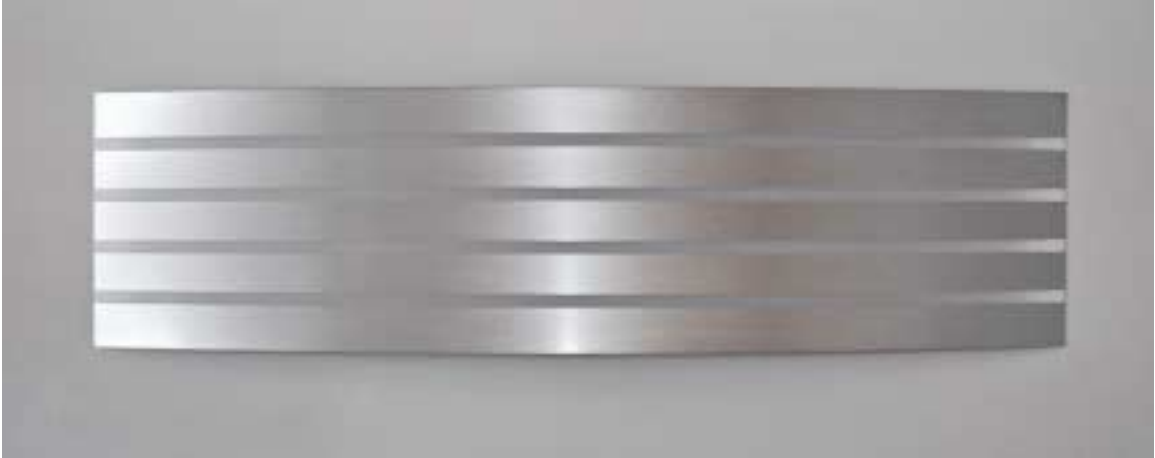
William Metcalf Stainless Steel Arc, 2007 Acrylic on polyester fabric, wood 31 x 120 x 8 1/2 inches WM0080