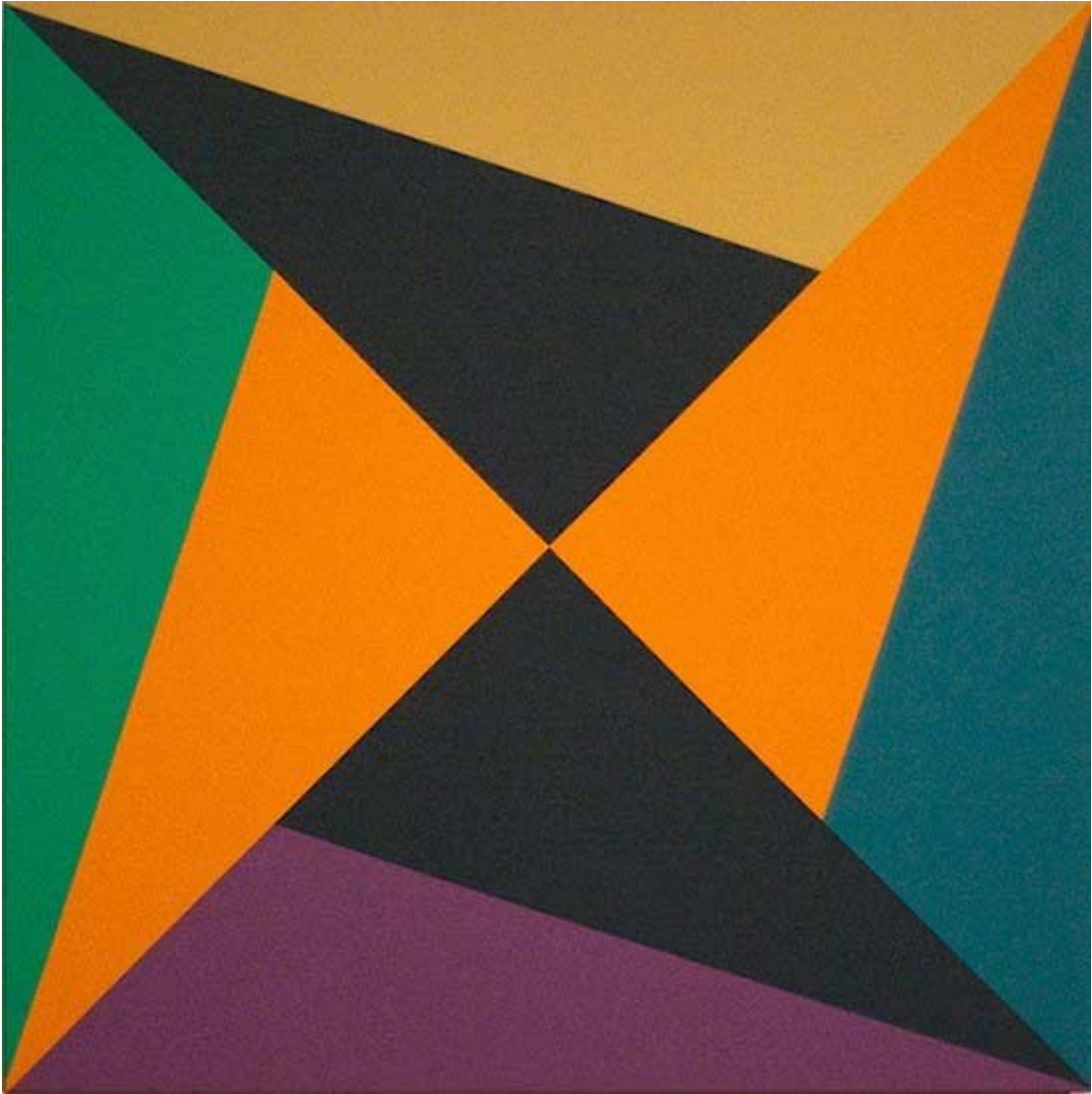
Ronald Davis Twenty-Four Triangles, 2009 Acrylic on expanded PVC 20 x 20 x 2 1/2 inches ROND0025