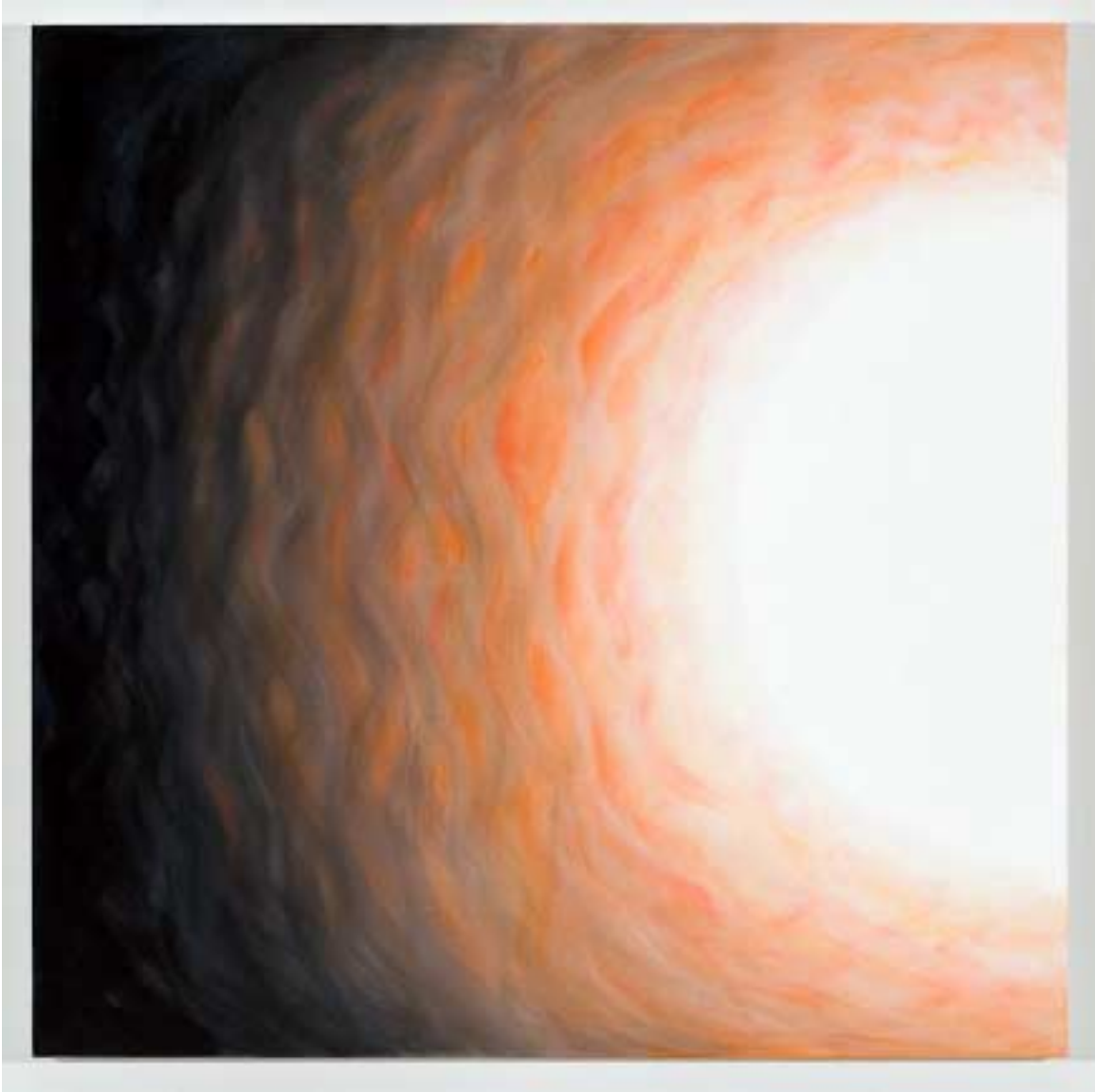
Untitled 34, 2013 oil on canvas 36 x 36 inches JW101