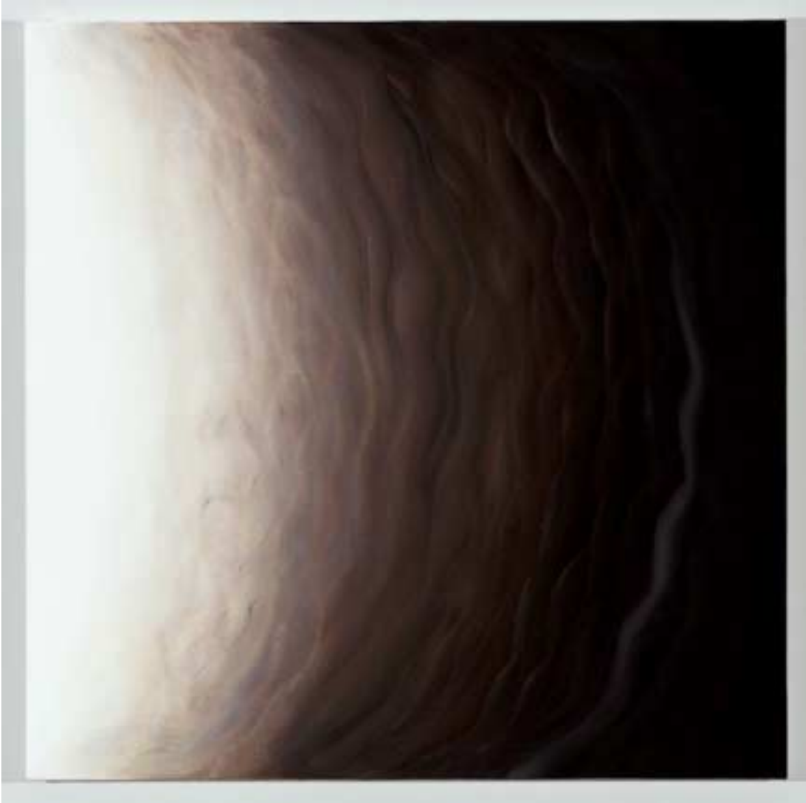
Untitled 27 Duo, 2013 oil on canvas 30 x 30 inches JW094