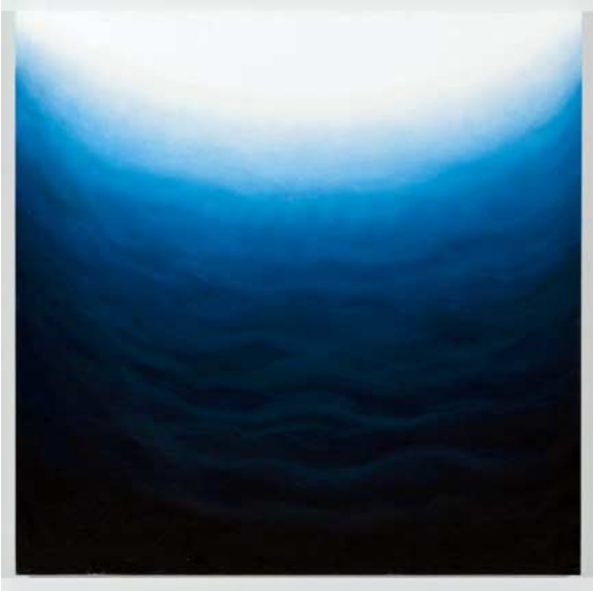
Untitled 38, 2013 oil on canvas 36 x 36 inches JW105