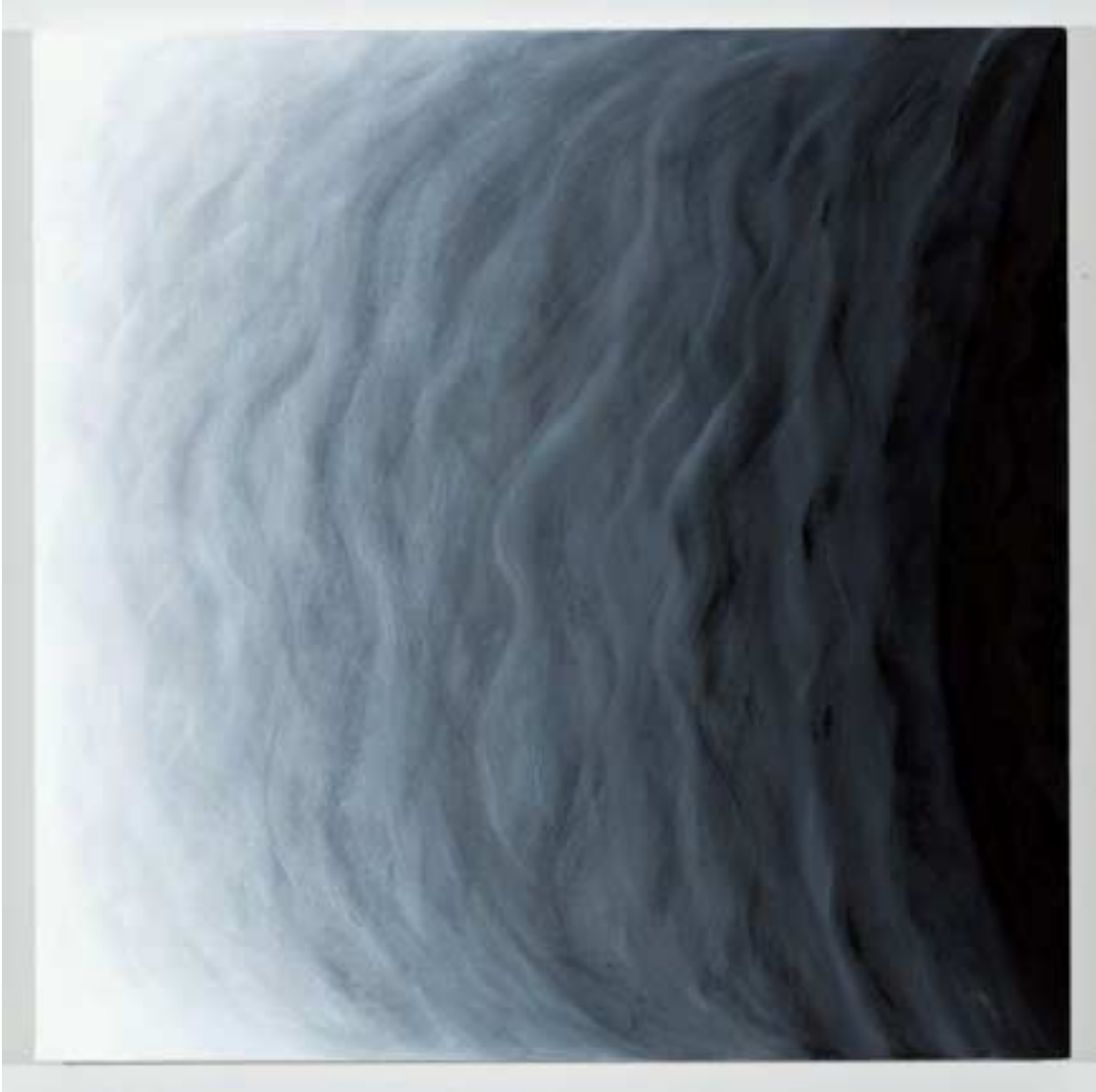
Untitled 24, 2013 oil on canvas 30 x 30 inches JW091