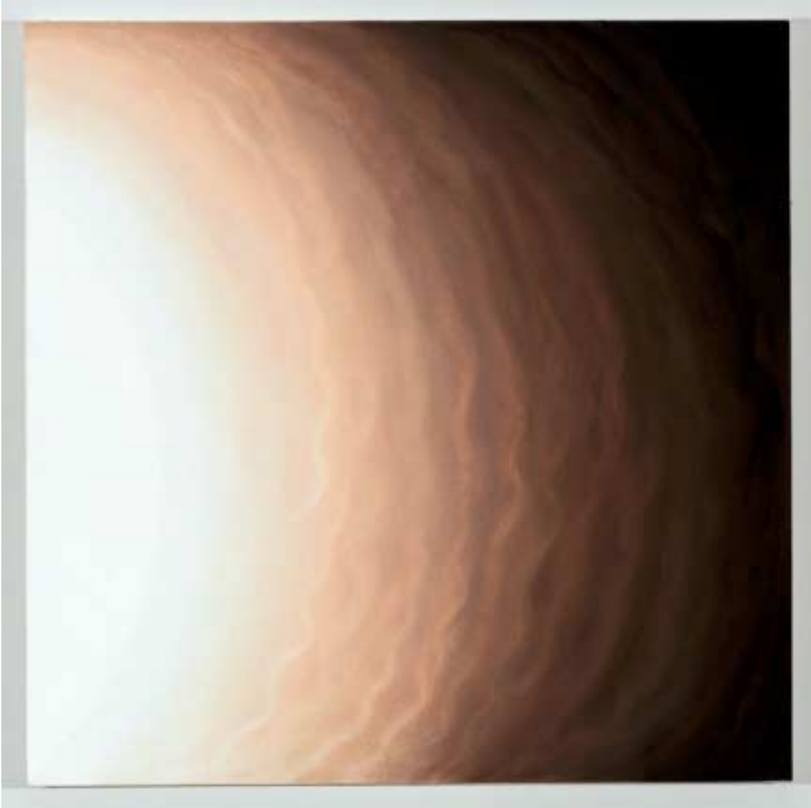
Untitled 29, 2013 oil on canvas 30 x 30 inches JW096