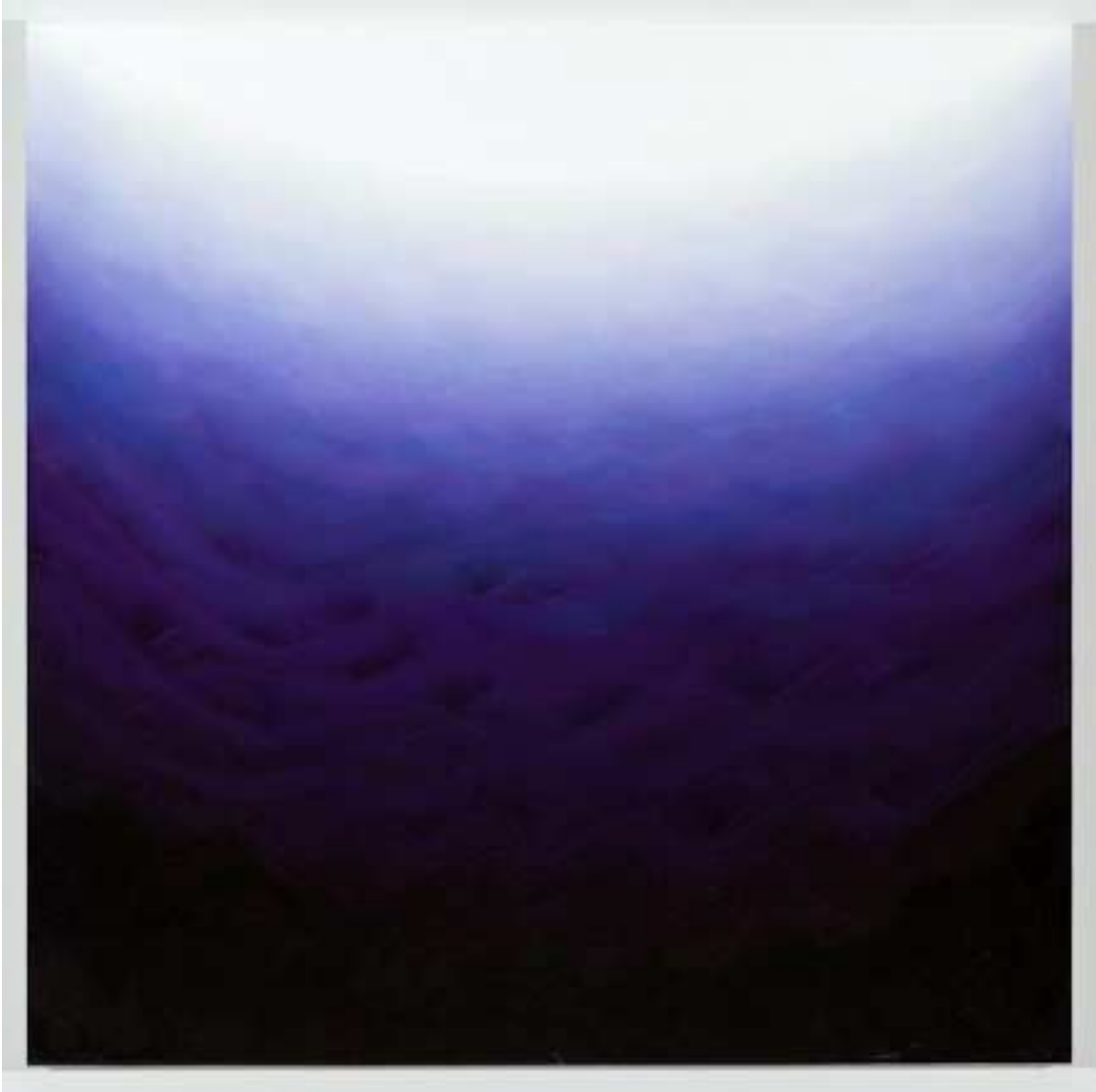
Untitled 39, 2013 oil on canvas 36 x 36 inches JW106