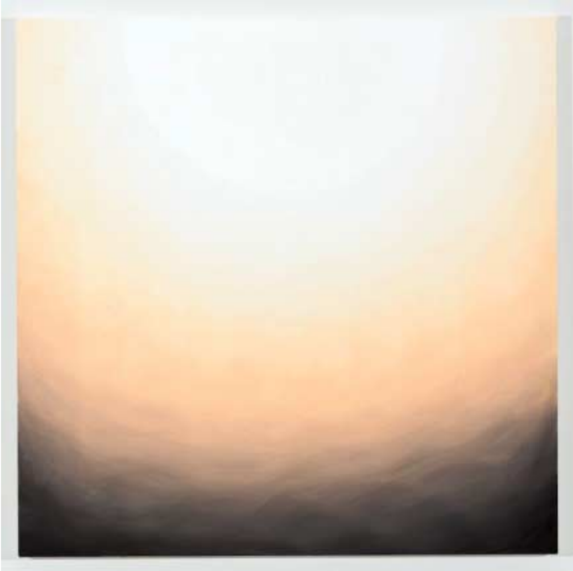
Untitled 31, 2013 oil on canvas 36 x 36 inches JW098