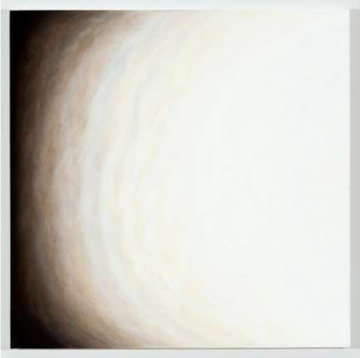
Untitled 28 Duo, 2013 oil on canvas 30 x 30 inches JW095