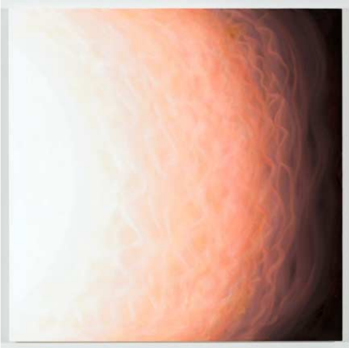
Untitled 35, 2013 oil on canvas 36 x 36 inches JW102