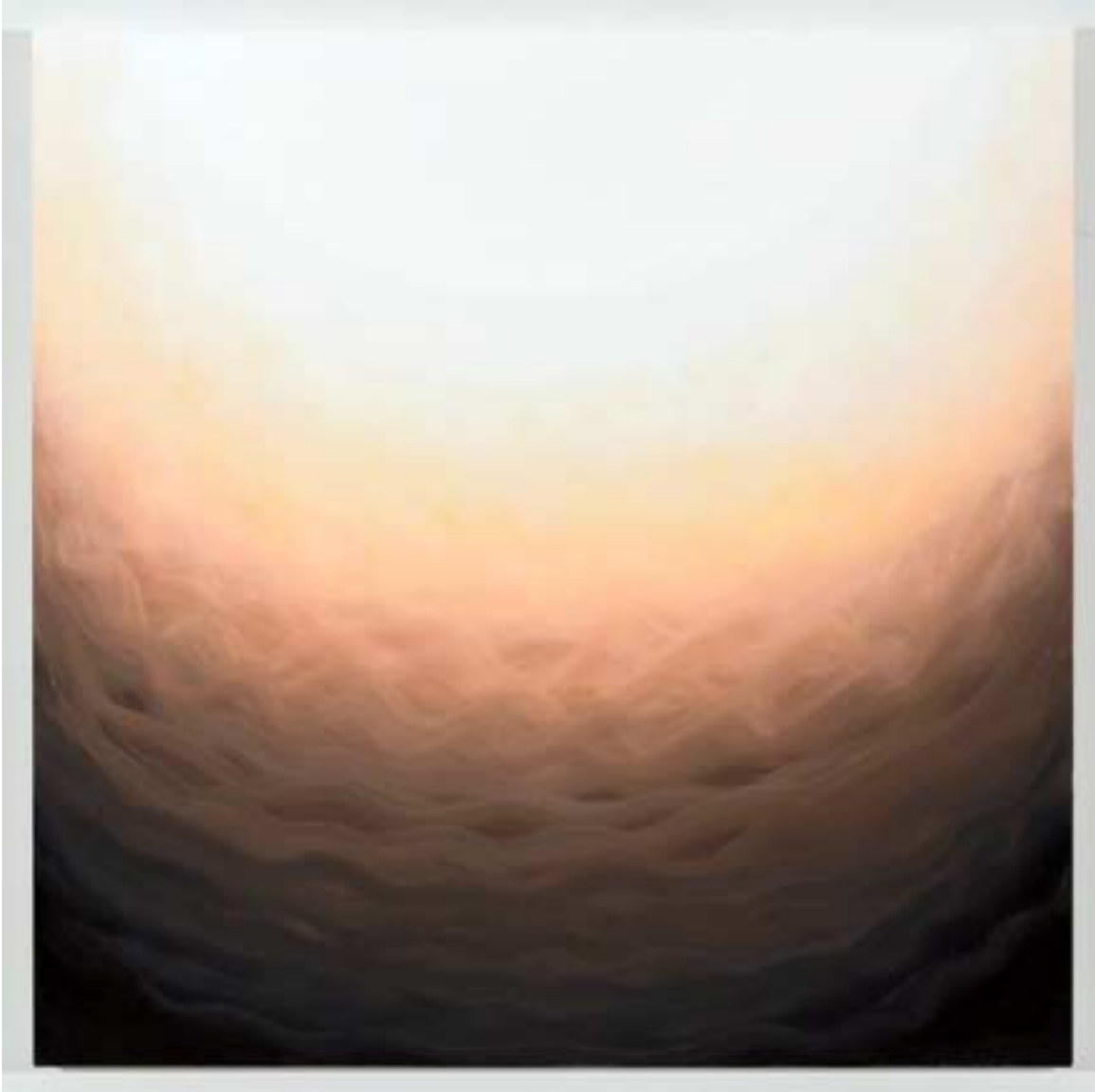
Untitled 32, 2013 oil on canvas 36 x 36 inches JW099