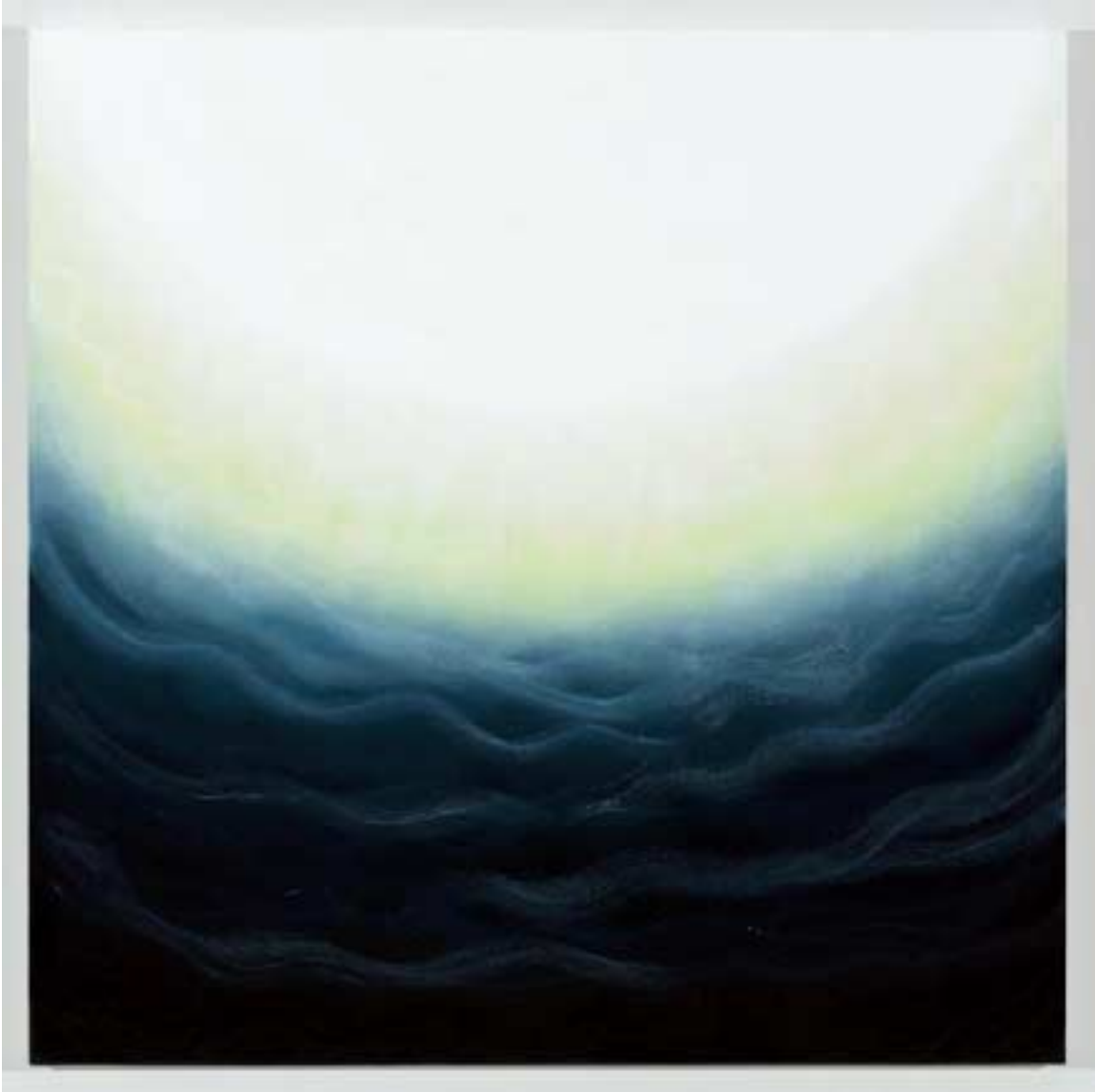
Untitled 40, 2013 oil on canvas 36 x 36 inches JW107