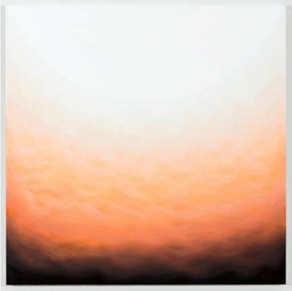
Untitled 36, 2013 oil on canvas 36 x 36 inches JW103