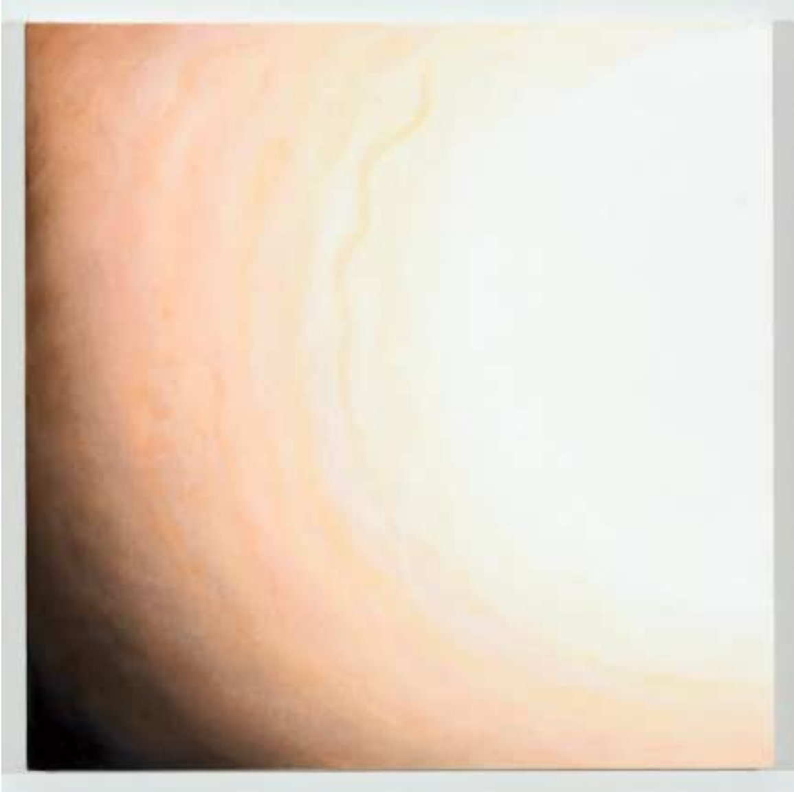
Untitled 30, 2013 oil on canvas 30 x 30 inches JW097