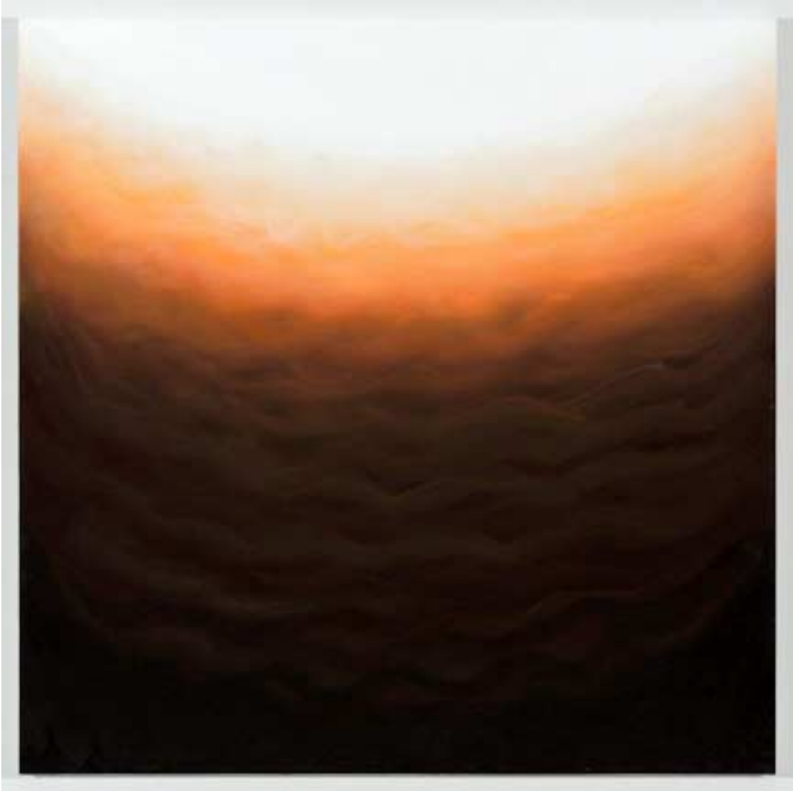
Untitled 37, 2013 oil on canvas 36 x 36 inches JW104