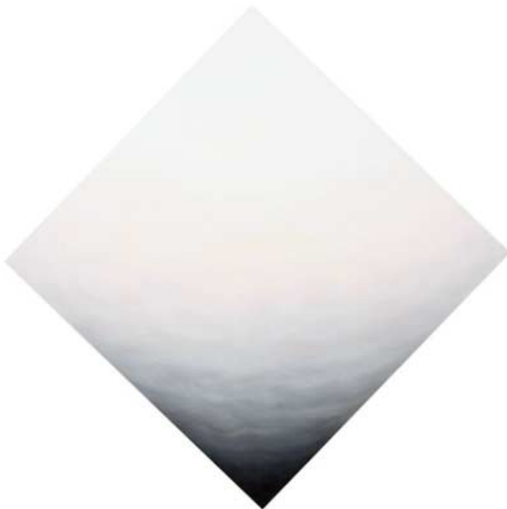
Diamond 6, 2013 oil on canvas 42 1/2 x 42 1/2 inches JW110