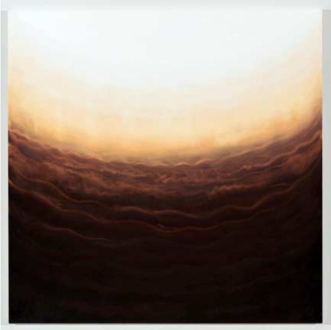
Untitled 33, 2013 oil on canvas 36 x 36 inches JW100