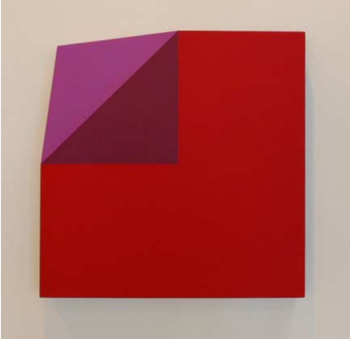
Ronald Davis Red and Violet Bent Corner Square, 2010 Acrylic on expanded PVC 24 x 24 x 3 inches Signed by the artist ROND0030