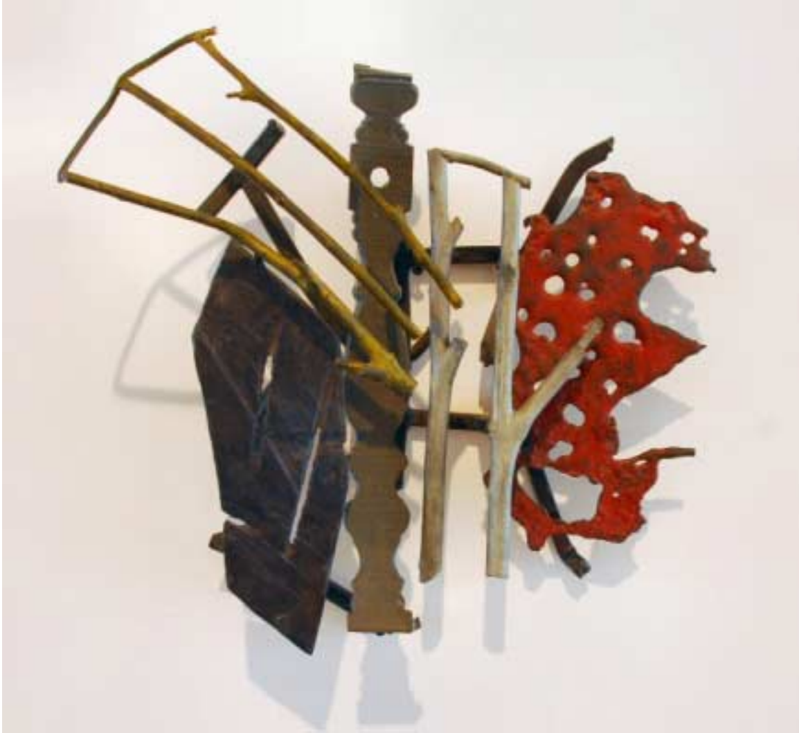
Charles Arnoldi Untitled, 1988 cast and welded bronze 19 x 18 x 5 inches CA133-RO