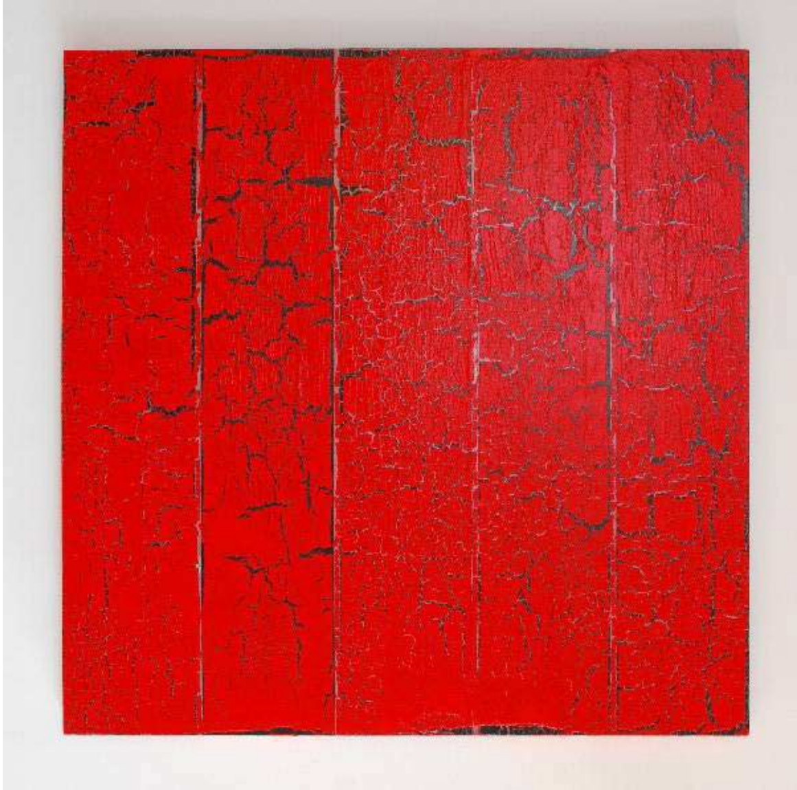
Ed Moses ACM #2, 2011 acrylic and glue on canvas 60 x 60 inches EM044