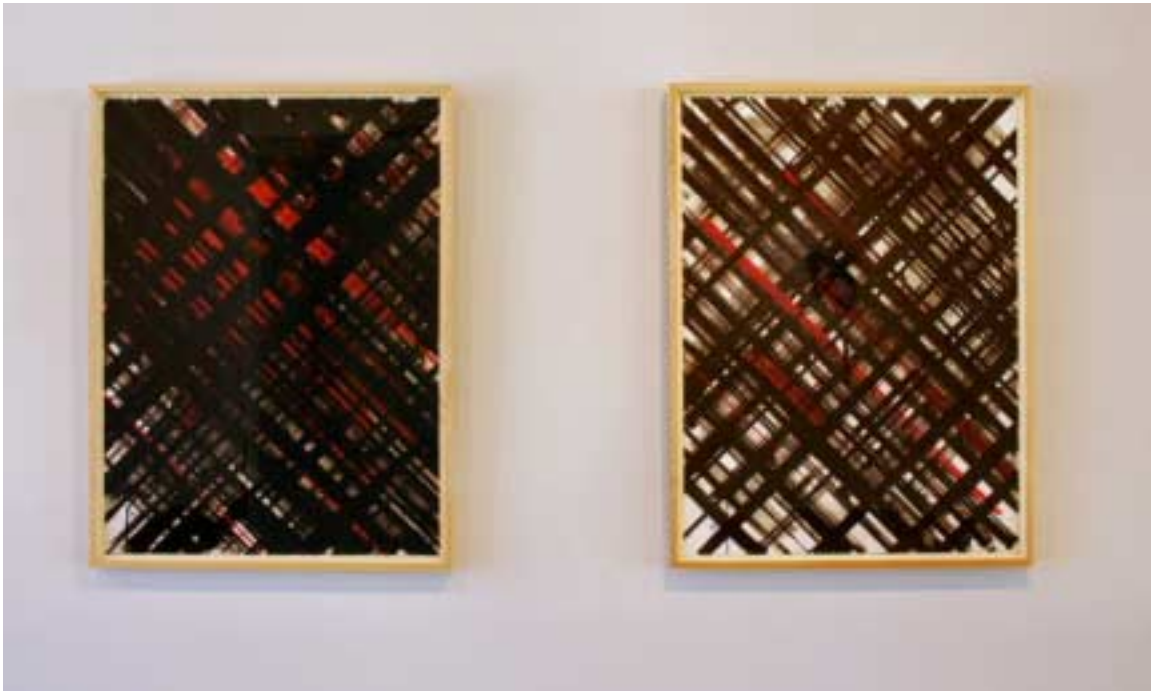
Ed Moses Untitled, 1976-2008 Acrylic & Masking Tape on Strathmore Board 49 x 37 1/2 inches EM29