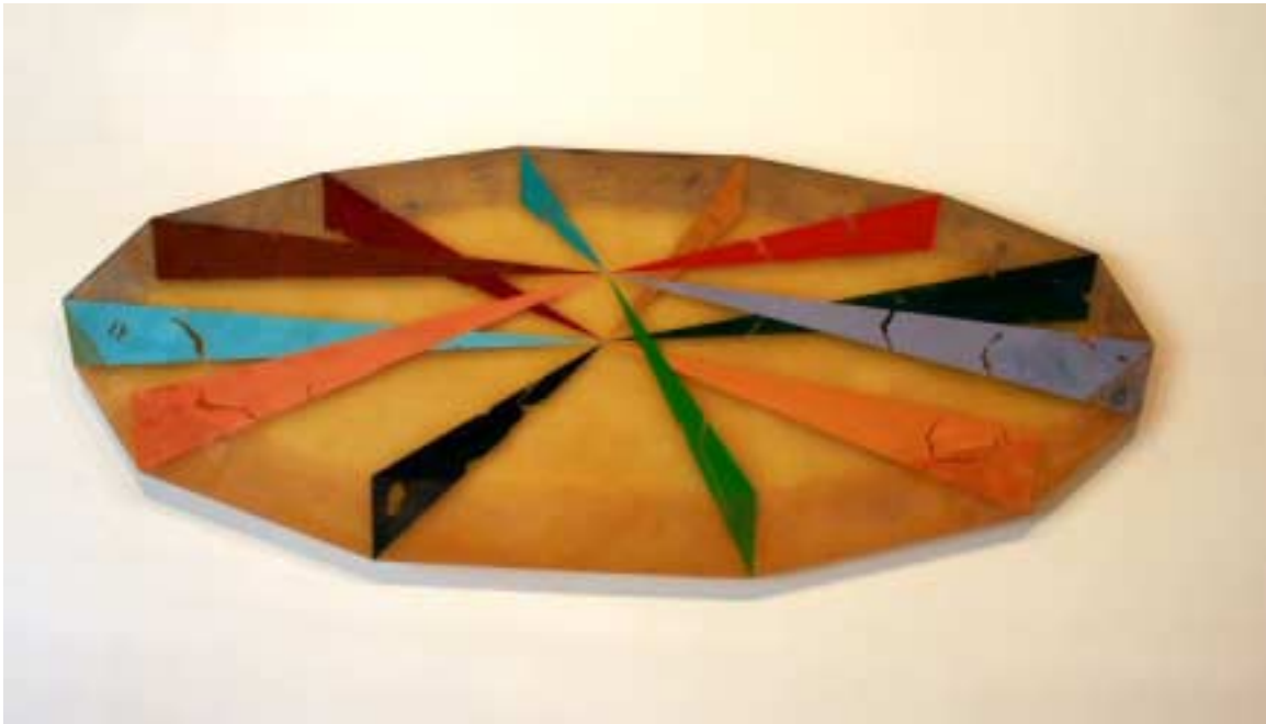
Ronald Davis Spindle, 1968 Moulded Polyester Resin and Fiberglass 50 1/2 x 132 inches ROND0052