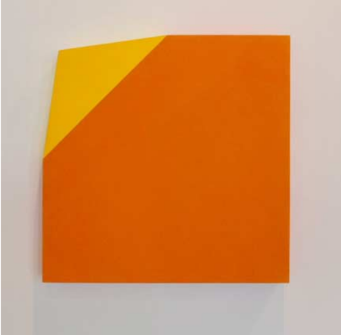
Ronald Davis Orange Bent Corner Square, 2010 Acrylic on Expanded PVC 24 x 24 x 3 inches ROND0051