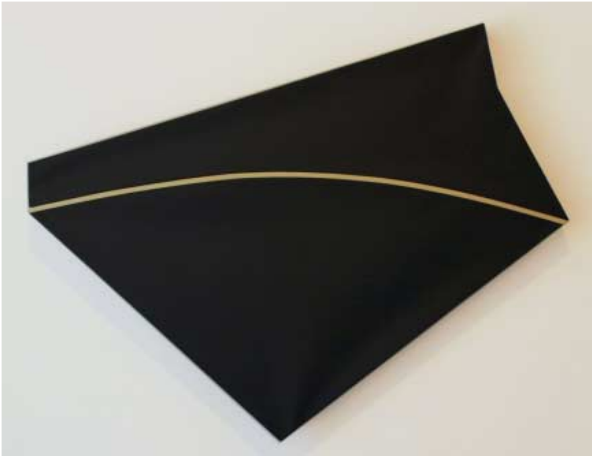
Tony DeLap The Real Secret, 2009 Acrylic on canvas 45 x 56 1/2 x 3 3/8 inches TD0078