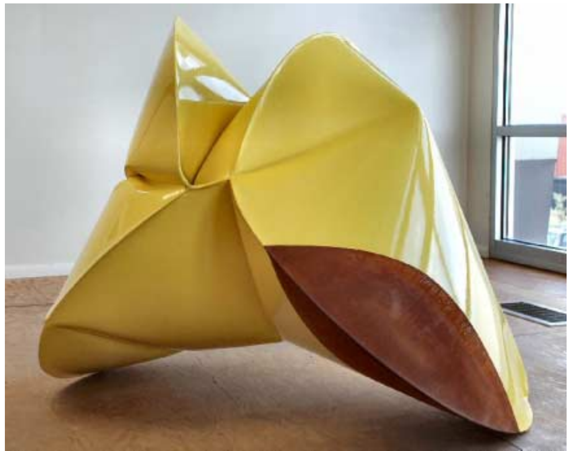
Ezeeon Yellow, 2008 forged mild steel and powder coat 40 x 47 x 40 inches JT159