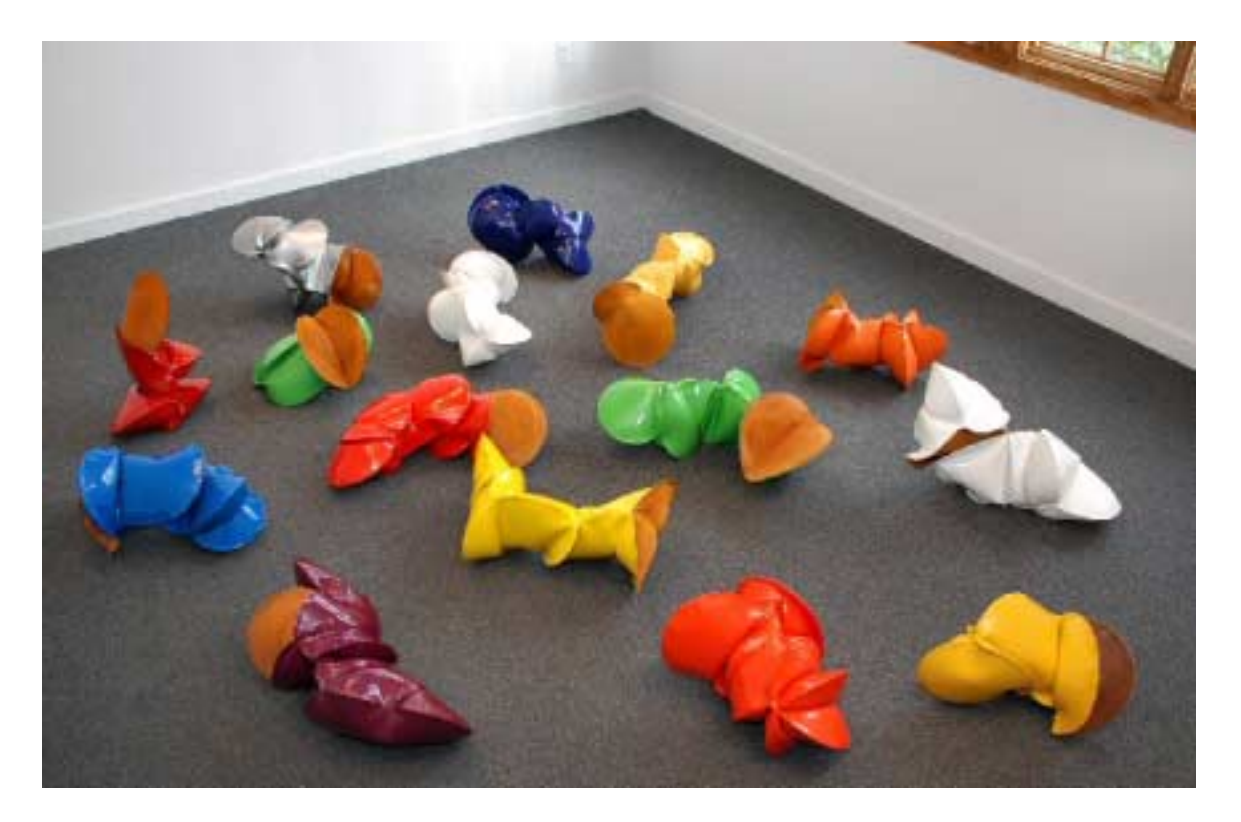
Various Titles, forged mild steel and powder coat, dimensions vary