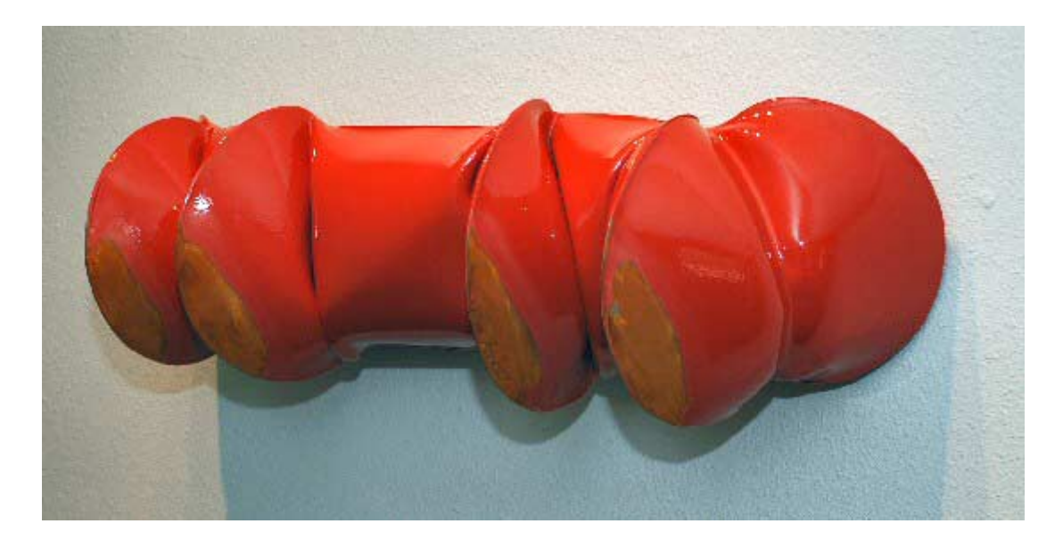
Brillion Red, 2008 forged mild steel and powder coat 11 x 36 1/2 x 11 1/2 inches JT152