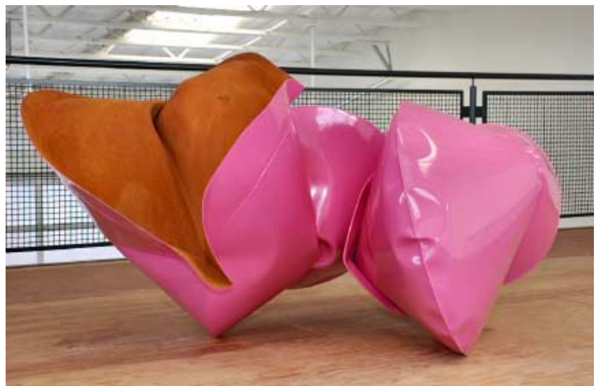
Stieger Panther Pink, 2008 forged mild steel and powder coat 40 x 71 x 52 inches JT163