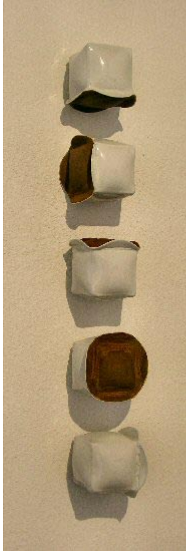
JEREMY THOMAS Ford Grey, 2004

Forged mild steel & powder coat, 3" x 4" x 3" (each) JT0028