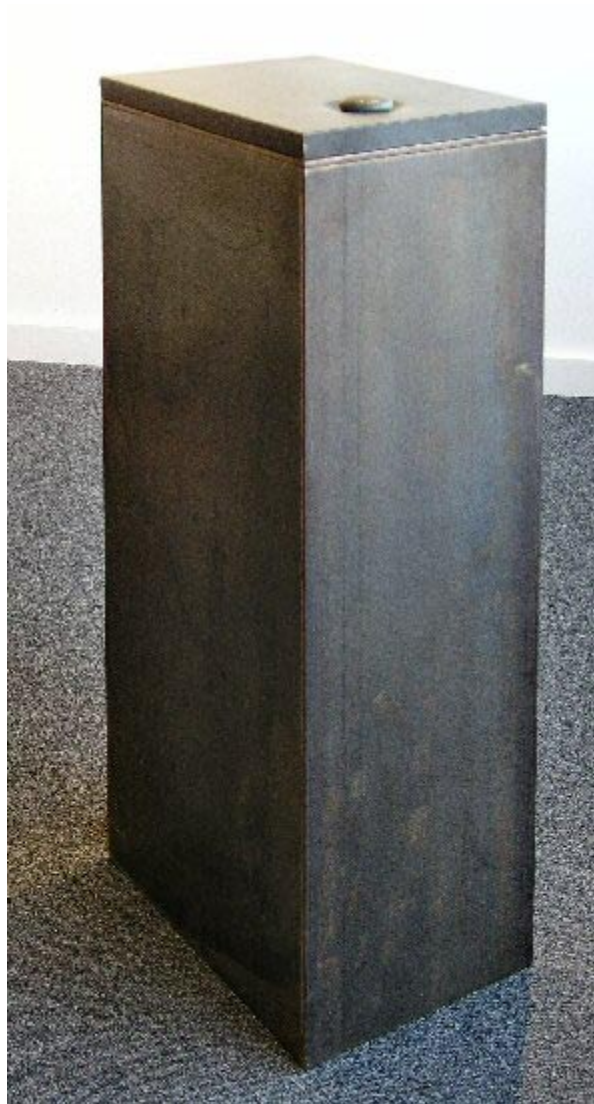
ELLIOT NORQUIST Large Piece for a Small Stone, 2005 Painted steel and stone, 18" x 12" x 38" EN0011