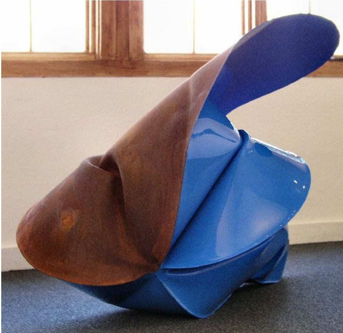
JEREMY THOMAS Monosem Blue, 2005 Forged mild steel & powder coat, 45" x 38" x 28" JT0046