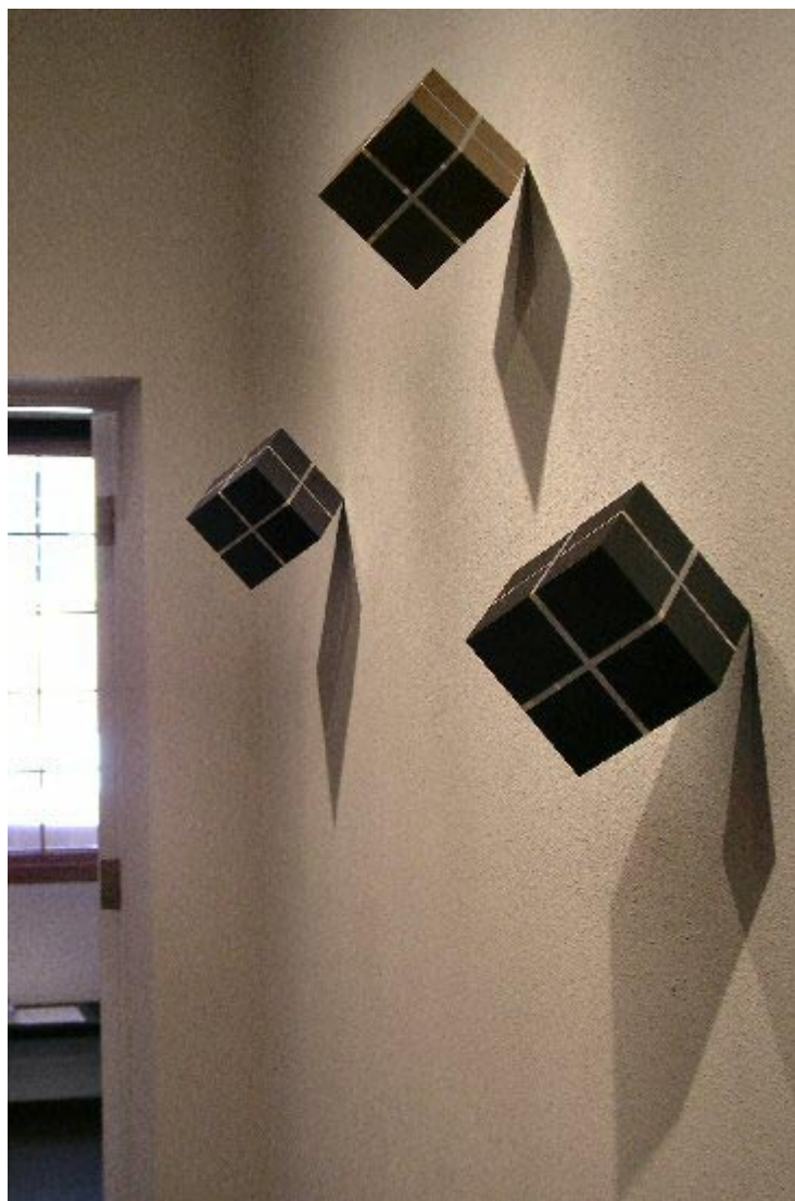
WILLIAM METCALF Cubes (installation of three), 2006 Acrylic on polyester fabric, 6" x 6" x 6" WM0057