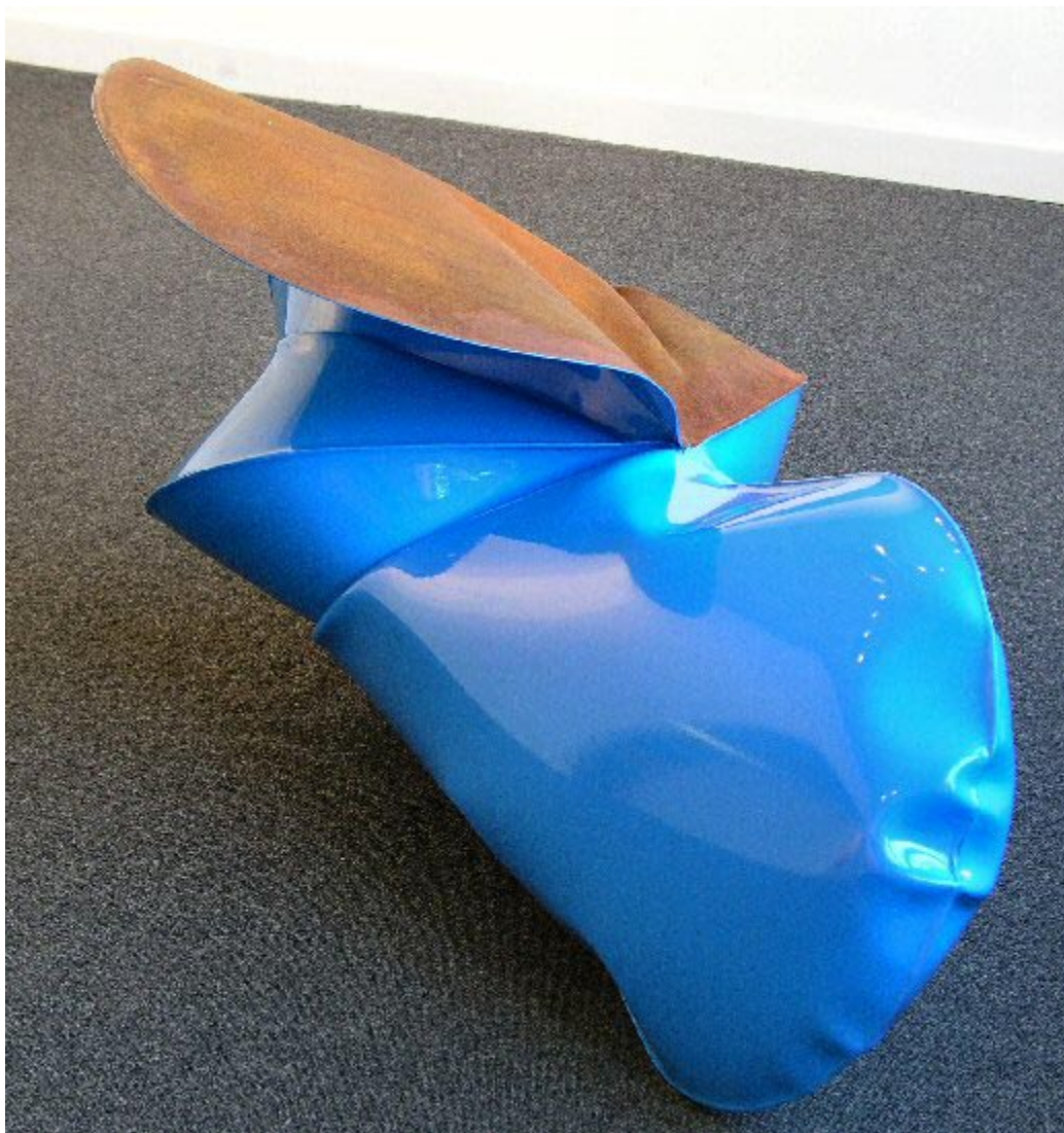
JEREMY THOMAS Monosem Blue, 2005 Forged mild steel & powder coat, 45" x 38" x 28" JT0046