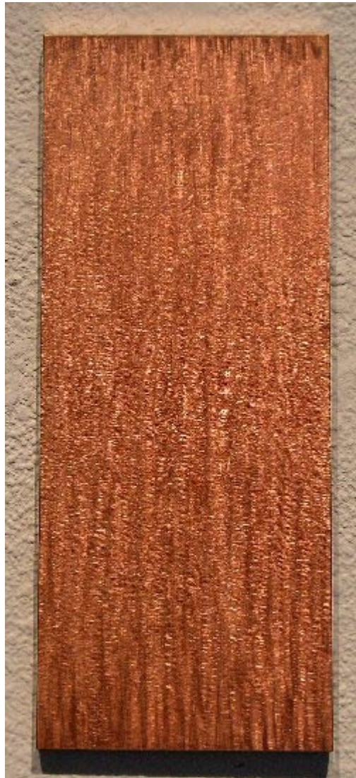
ROY THURSTON 2006-1, 2006 Etched copper, 12 1/8" x 5 1/16" x 3/8" RT010