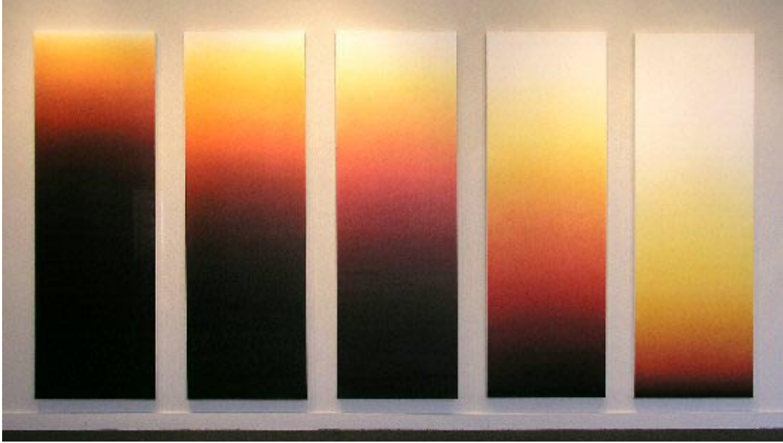
JOAN WATTS Suite, 2005 Oil on canvas, 72" x 144" JW010