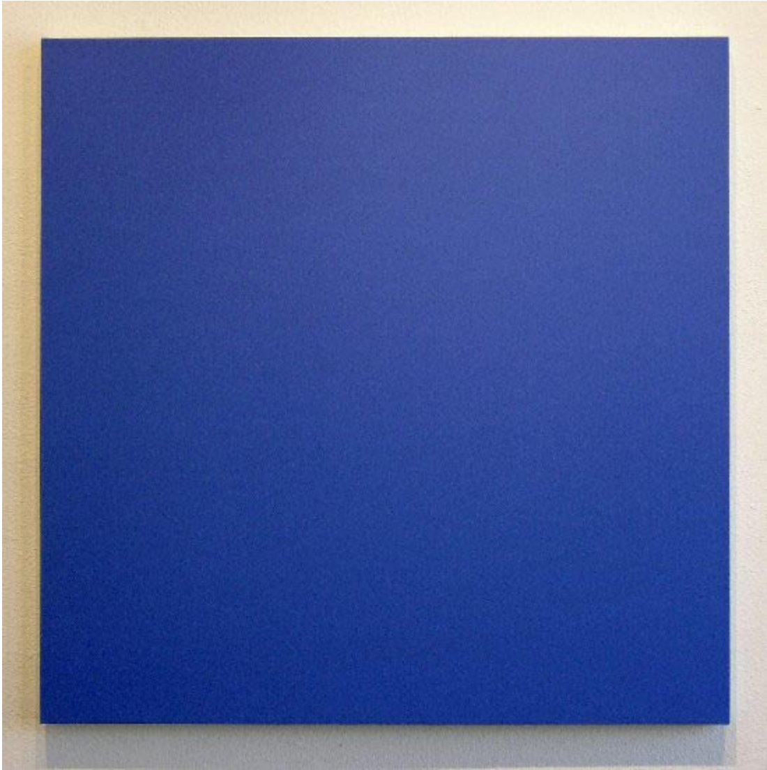
RUDOLF DE CRIGNIS #01-39, 2001 Oil on canvas, 30" x 30" RD004