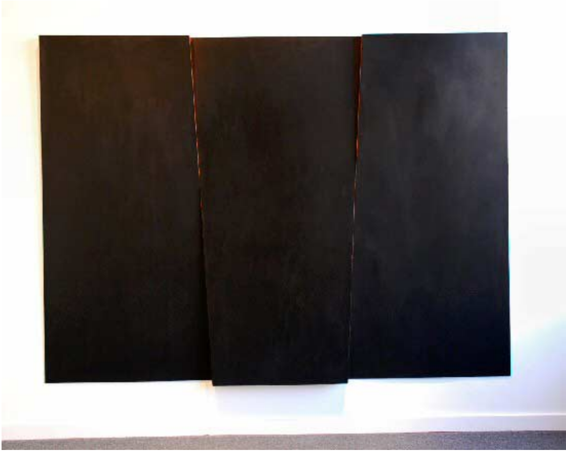
Big Black Work with Three Tilting Planes #2, 2008 copper 72 x 104 inches CD082