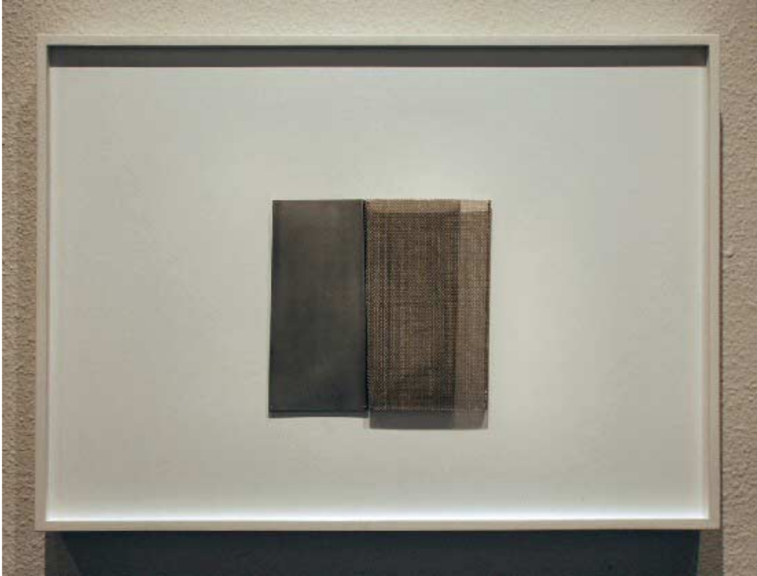
Rendering 2° 6, 2008 aluminum, stainless steel, silver 14 x 19 inches CD040