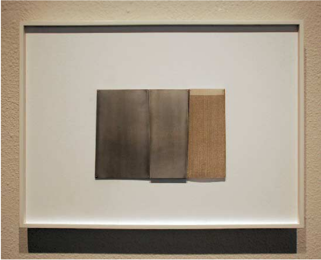
Rendering 2° 8, 2008 aluminum, stainless steel, silver 14 x 19 inches CD042