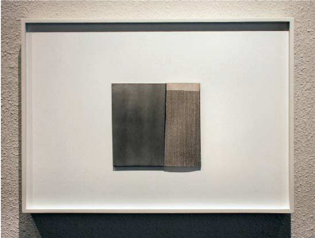
Rendering 2° 1, 2008 aluminum, stainless steel, silver 14 x 19 inches CD035