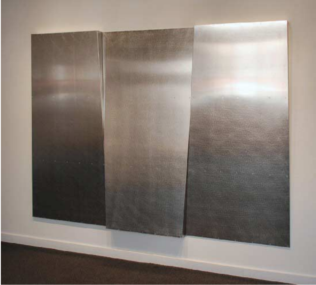
Untitled Aluminum, 2008 aluminum 72 x 104 inches CD080