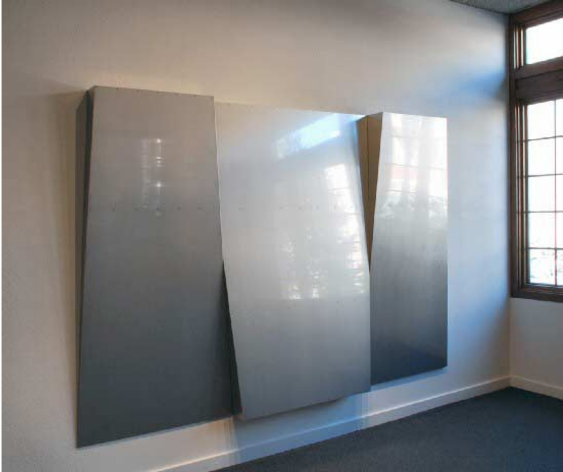
Untitled Stainless, 2008 stainless steel with a mill finish 72 x 114 inches CD079