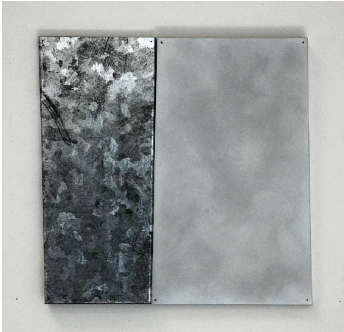
Metal Study #12, 2008 Metal on gatorboard 14 x 19 inches CD048