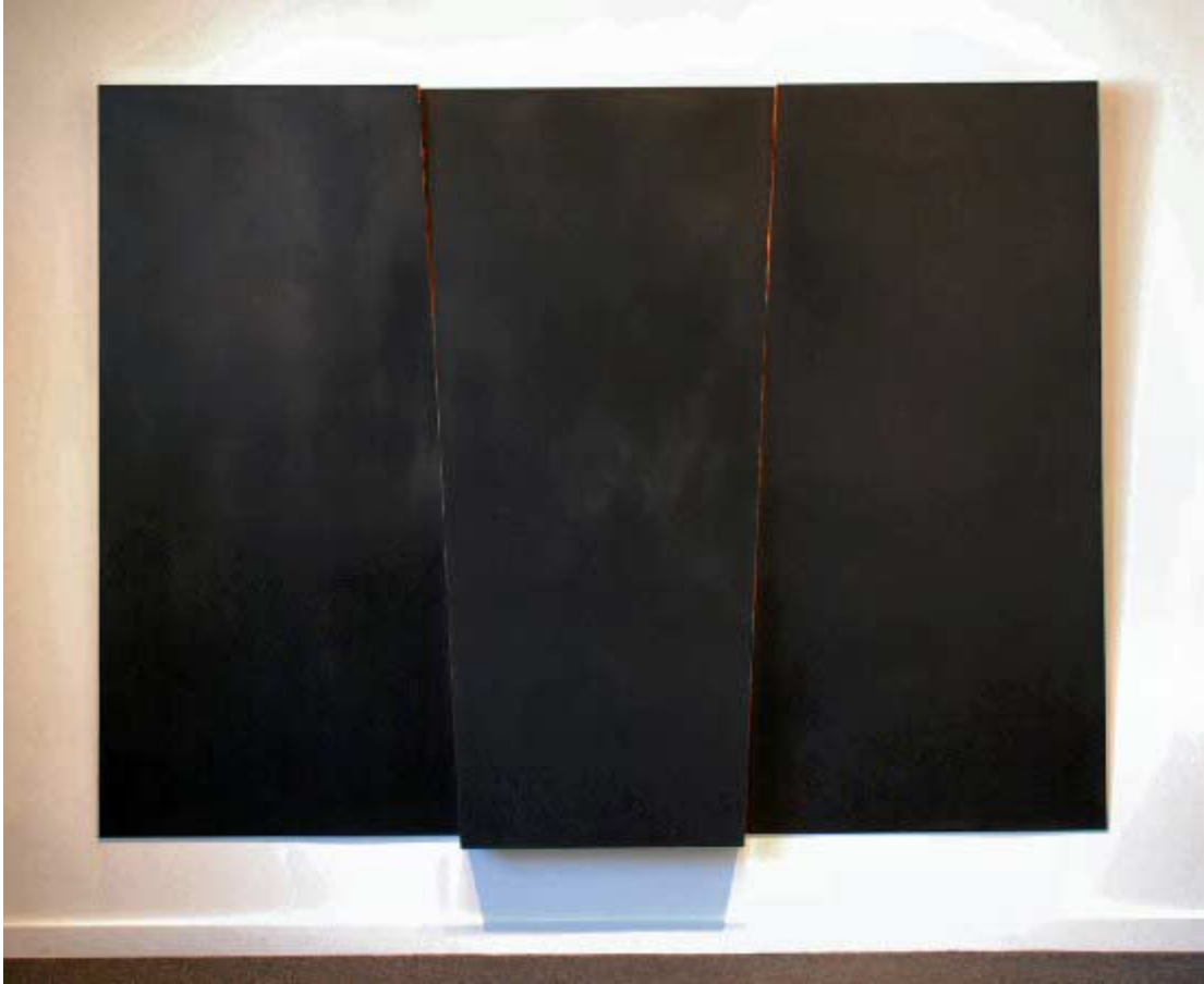
Big Black Work with Three Tilting Planes #1, 2008 copper 72 x 104 inches CD081