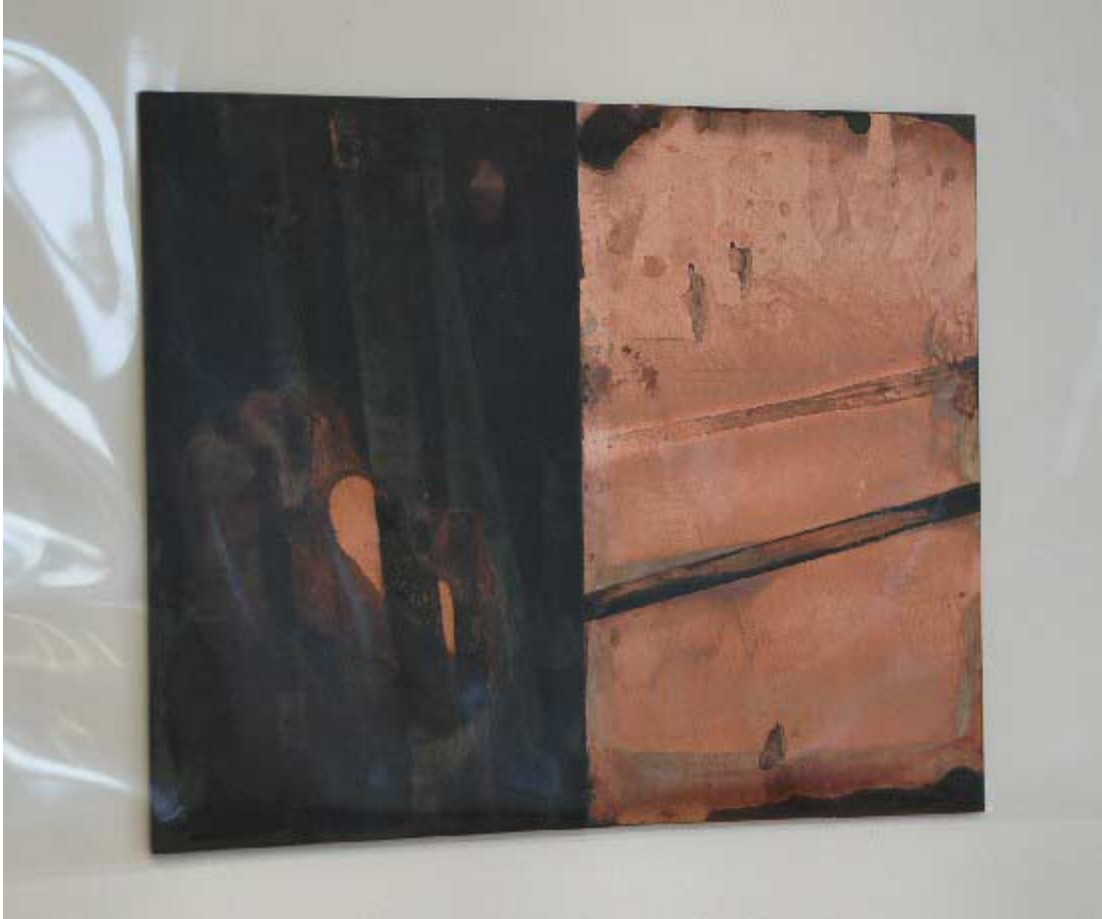
Stained Copper Study #5, 2008 copper on board in vinyl sheet 6 x 7 1/2 inches CD070