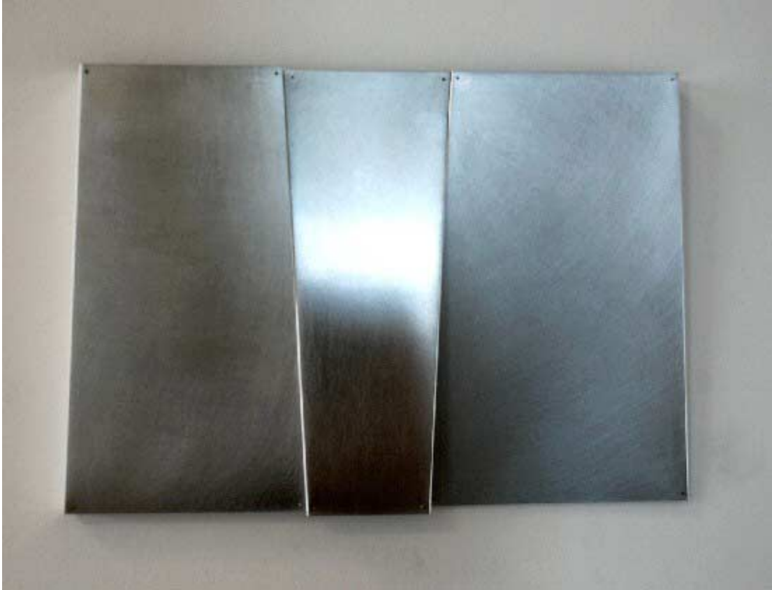
Aluminum Units 1,2,3, 2008 aluminum, 72 x 108 inches CD043