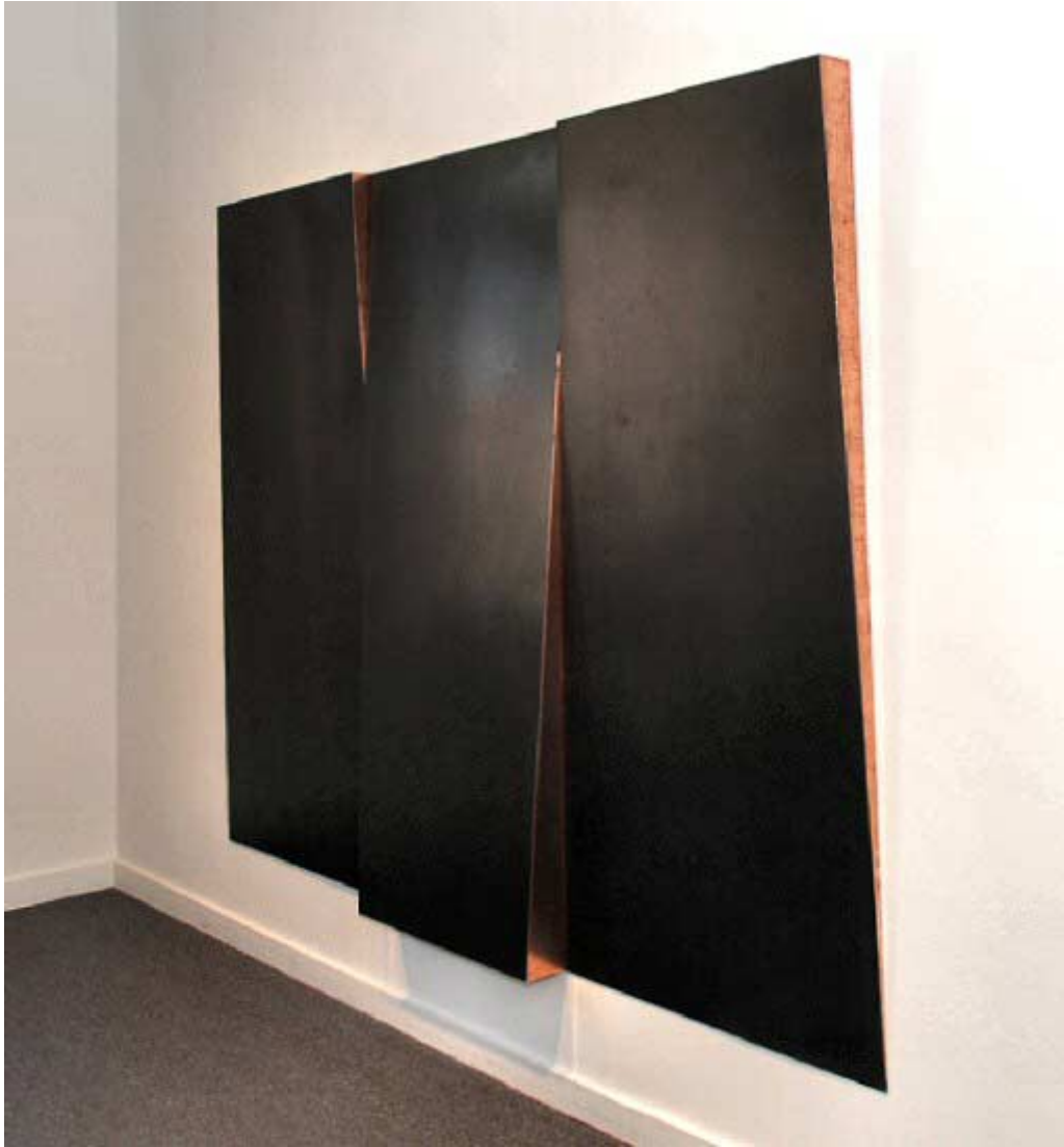
Big Black Work with Three Tilting Planes #2, 2008 copper 72 x 104 inches CD082 (detail)