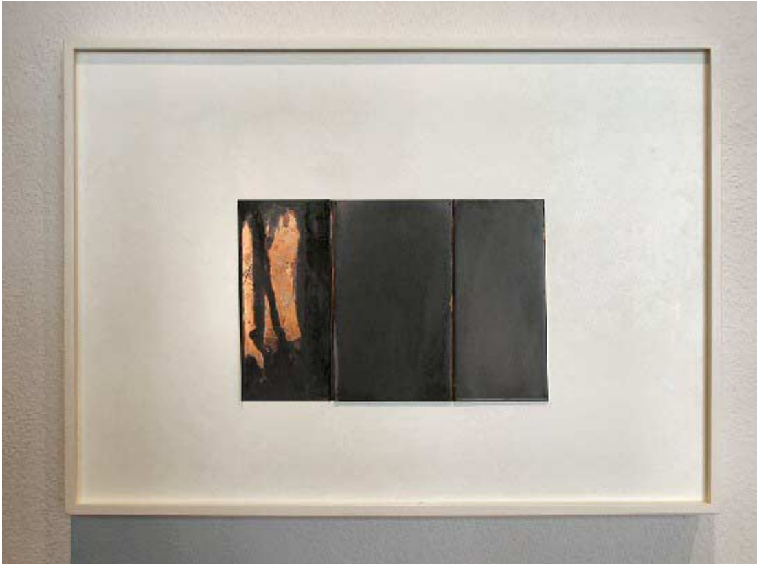
Stained Copper Painting #4, 2008 patina stained copper with varnished acrylic on panel 12 x 19 inches CD077