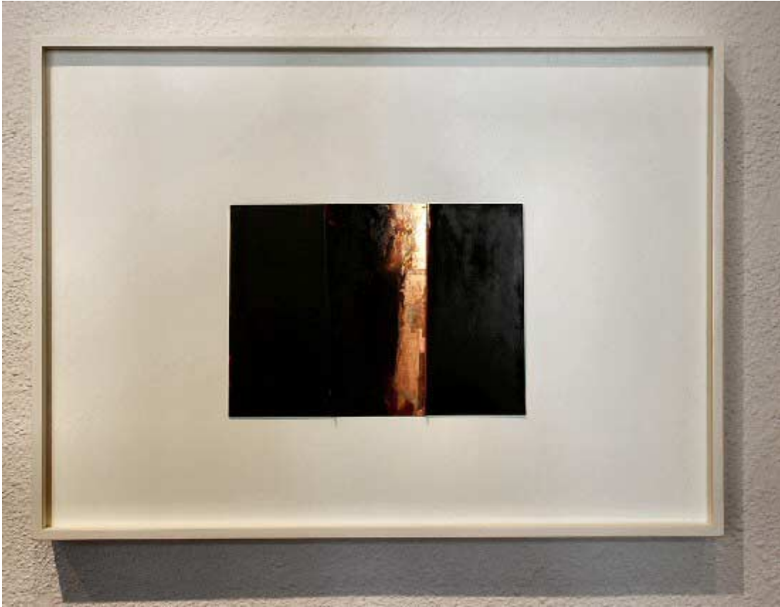
Stained Copper Painting #1, 2008 patina stained copper with varnished acrylic on panel 12 x 19 inches CD078