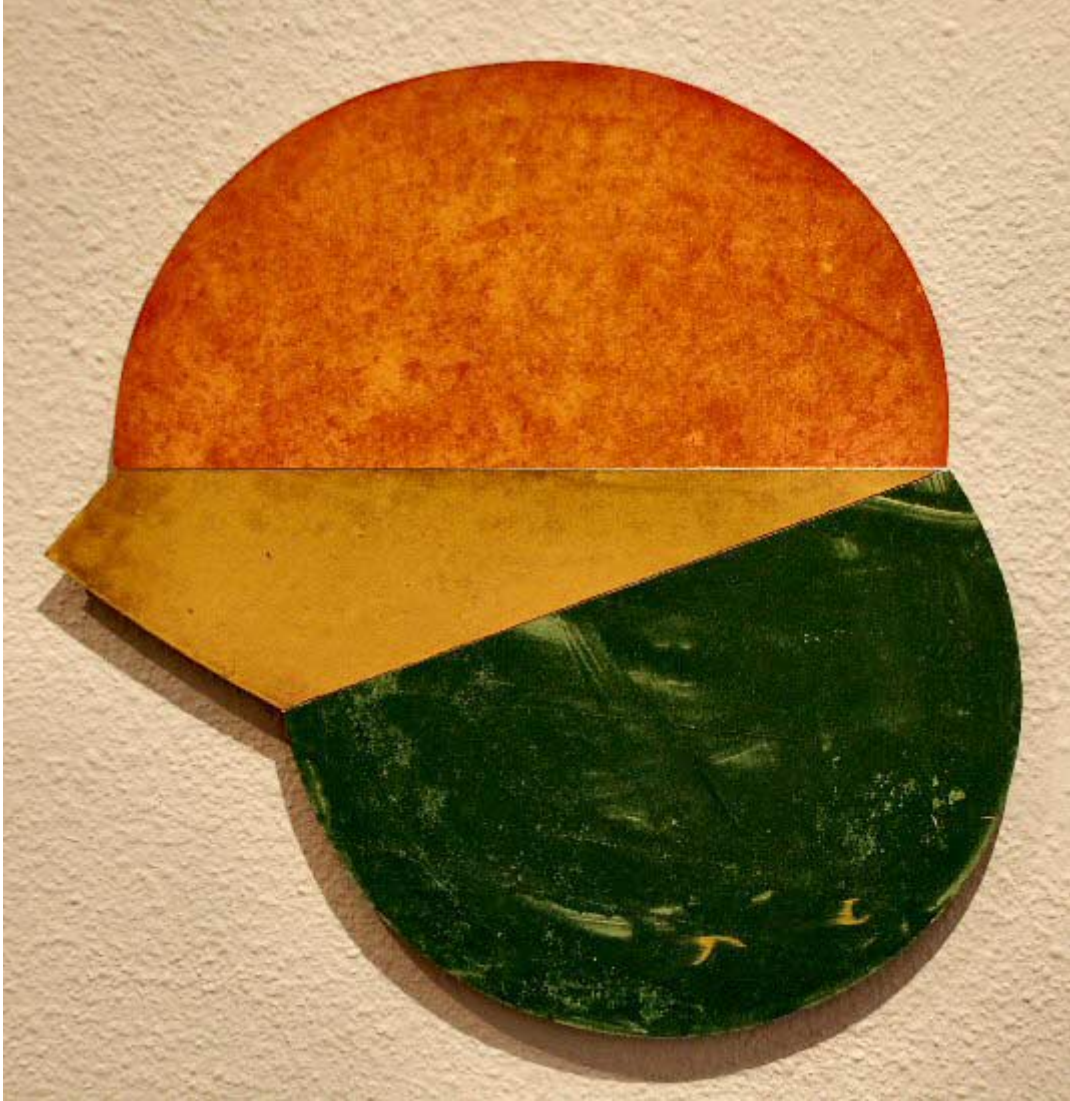
Untitled, 2005 Oil on aluminum 12 x 12 x 1/2 inches CA002