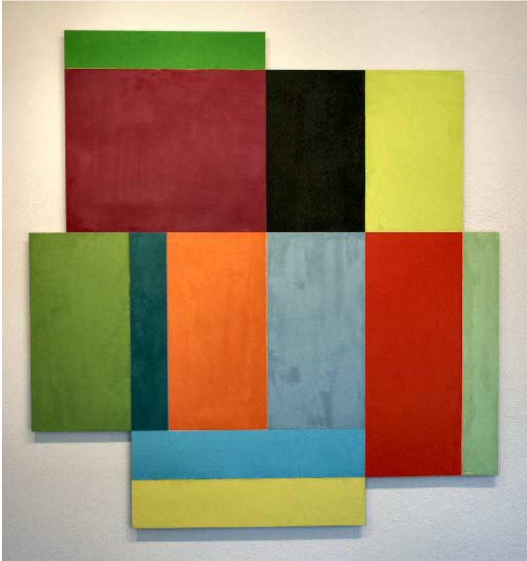
Era, 2007 oil on aluminum 60 x 57 inches CA0043