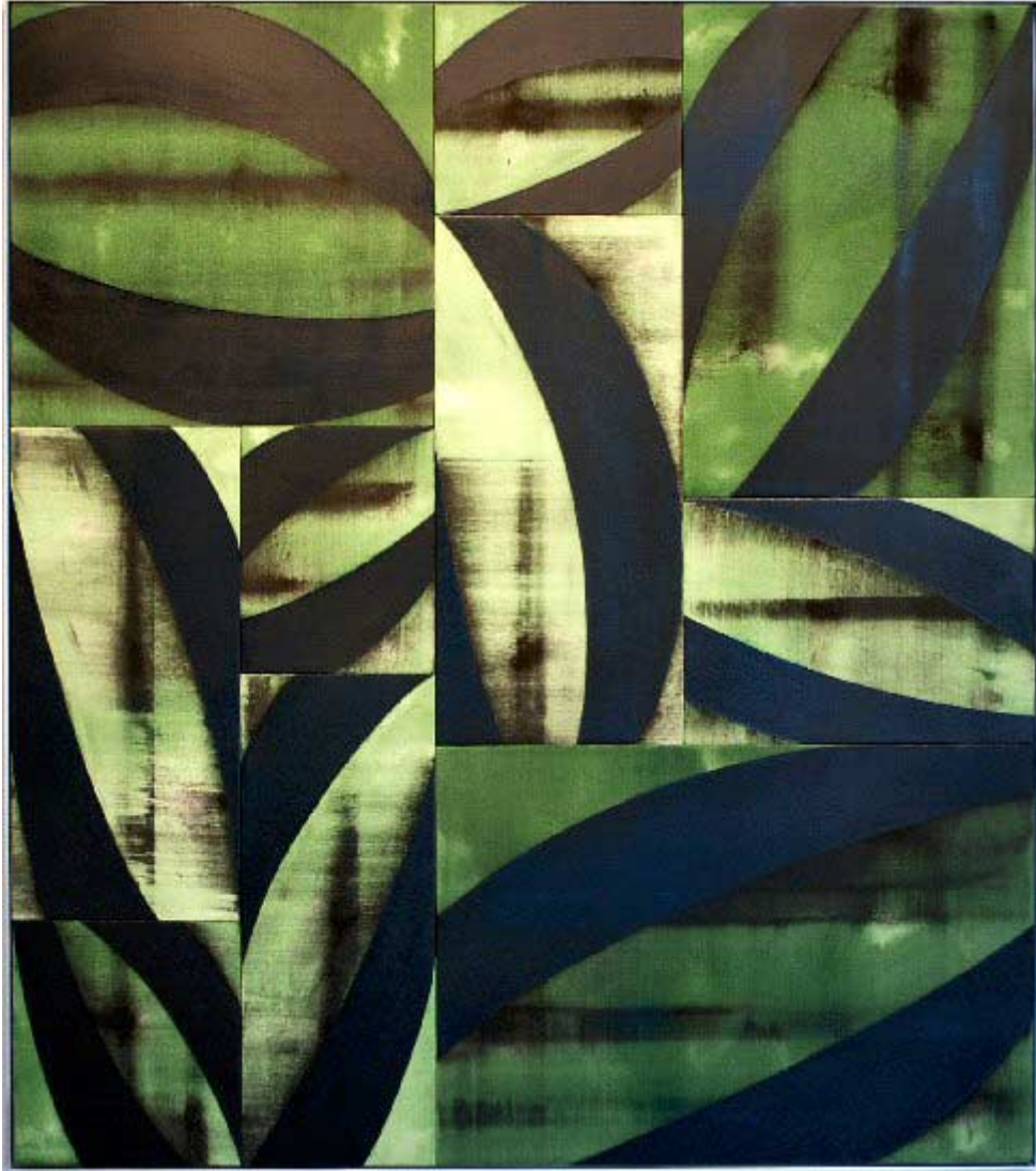
Habitat, 2007 Acrylic on canvas 66 3/4 x 58 3/4 inches CA0020