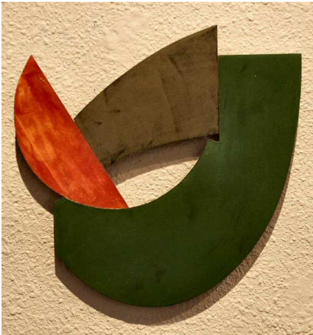
Untitled, 2005 Oil on aluminum 8 1/2 x 6 3/4 inches CA0026