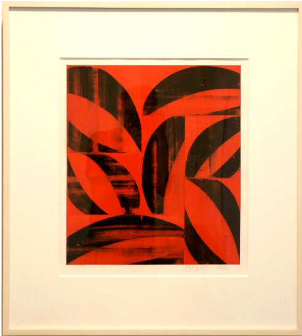
Untitled, 2006 Gouache on paper 26 1/2 x 24 inches CA0019