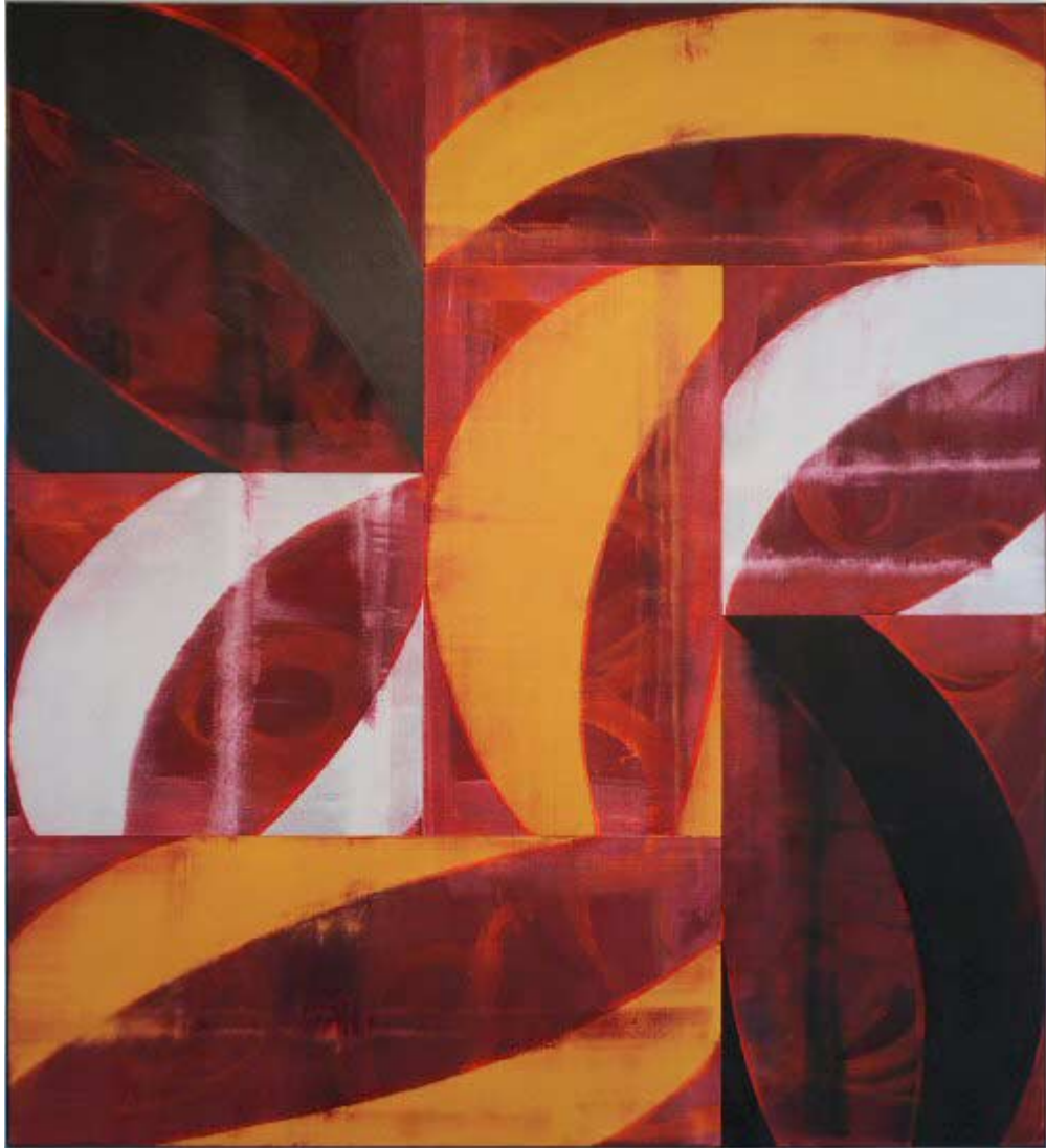
Meteor, 2007 acrylic on canvas 88 x 80 inches CA0045