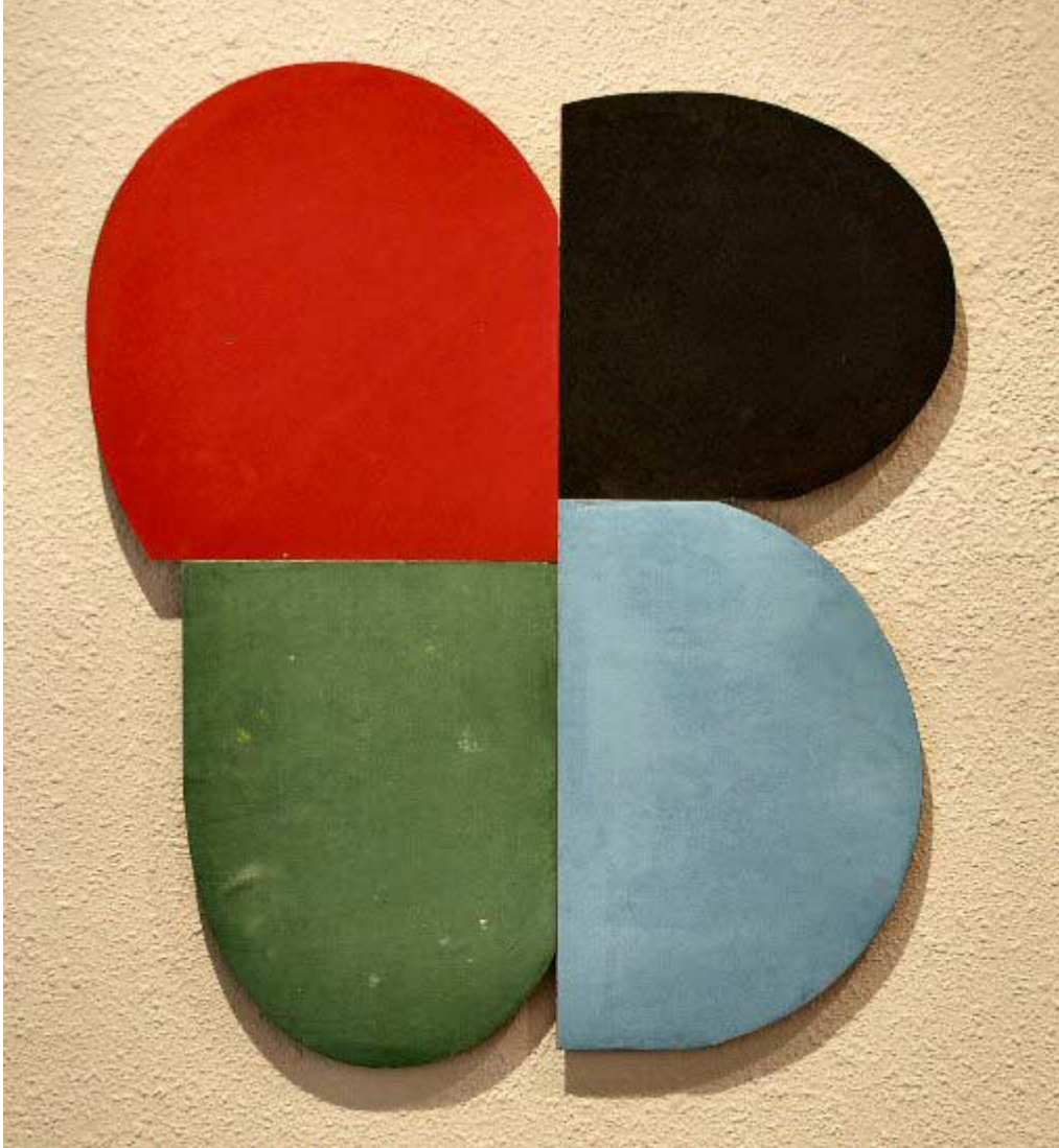
Untitled (Z Series), 2005 oil on aluminum 20 1/2 x 17 3/4 inches CA0039