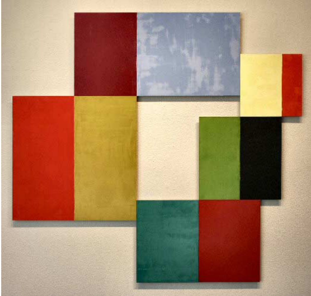
Zig Zag, 2007 oil on aluminum 50 5/8 x 54 5/8 inches CA0042