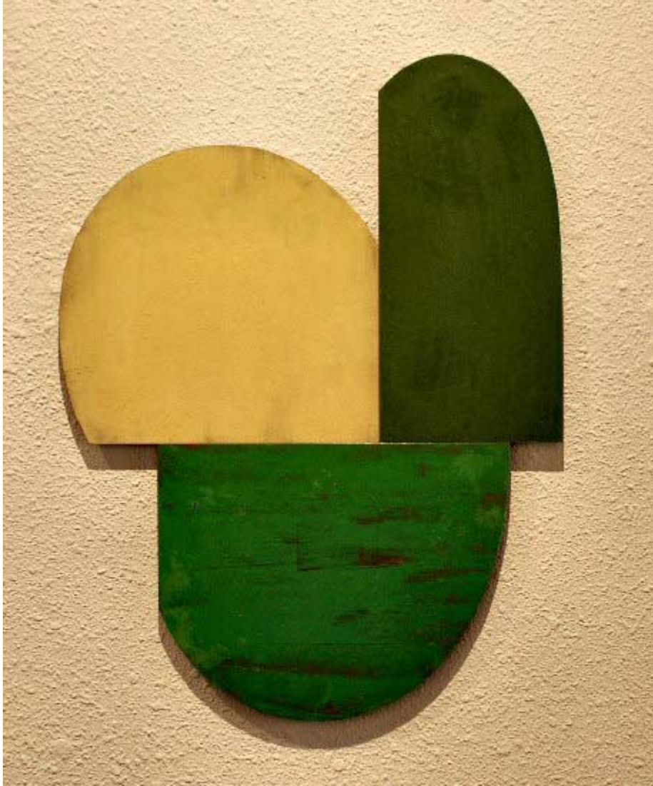
Untitled, 2005 oil on aluminum 20 x 15 1/8 inches CA0040