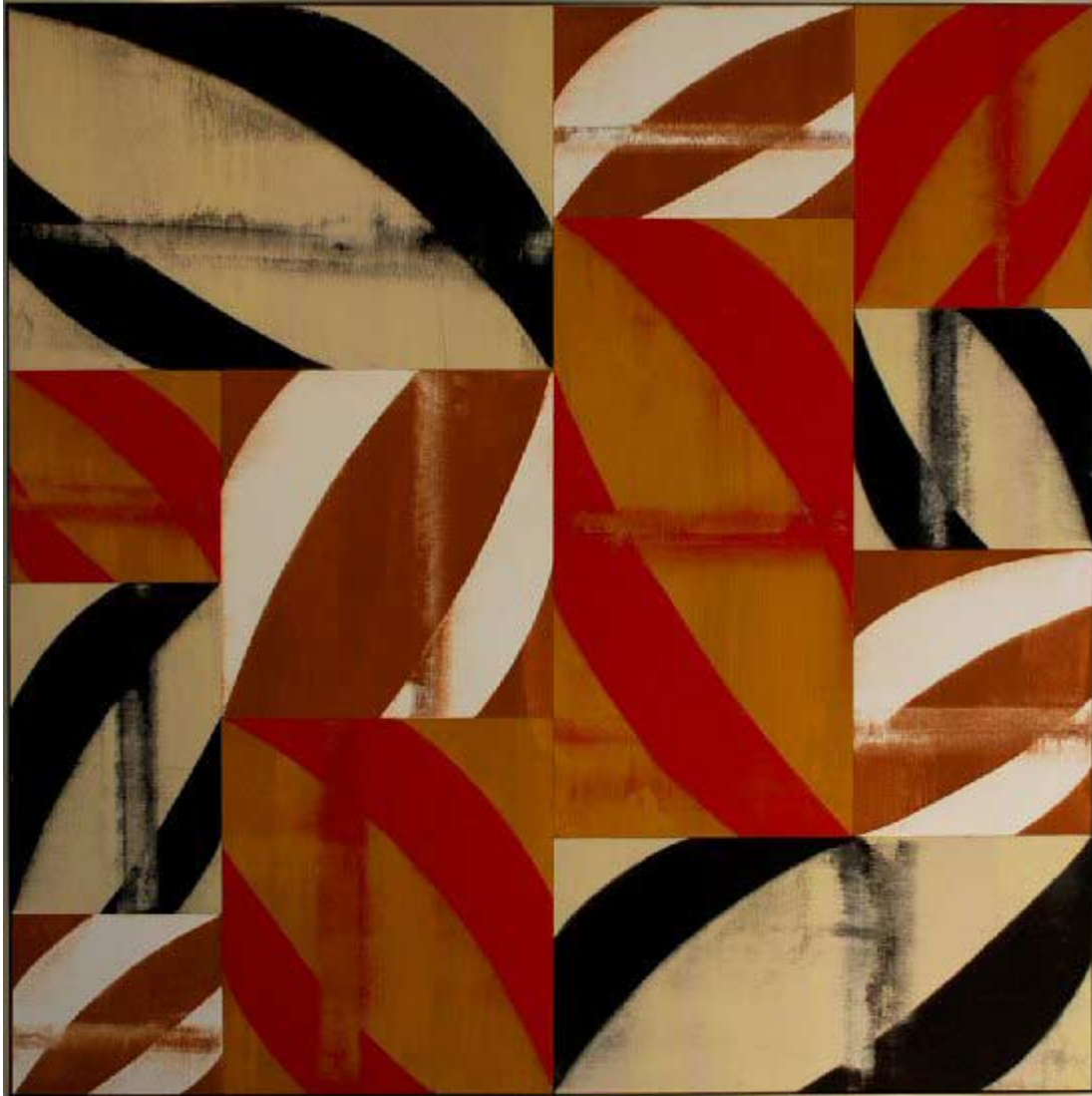
Walking Rain, 2007 acrylic on canvas 72 x 72 inches CA0038