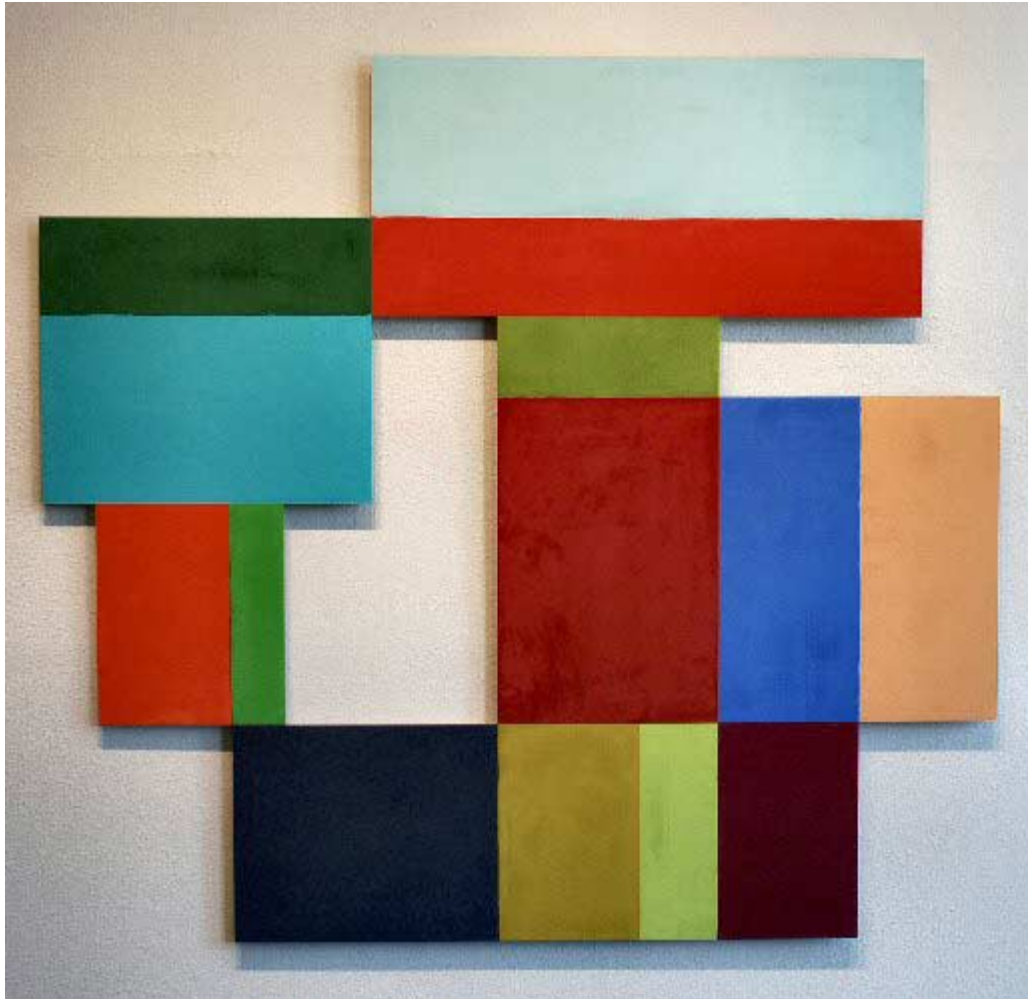
Fourth Corner, 2007 oil on aluminum 50 x 54 inches CA0036