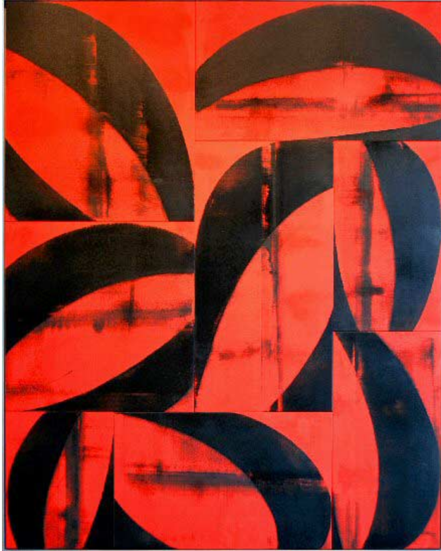
Firewall, 2007 acrylic on canvas 75 x 60 inches CA0041