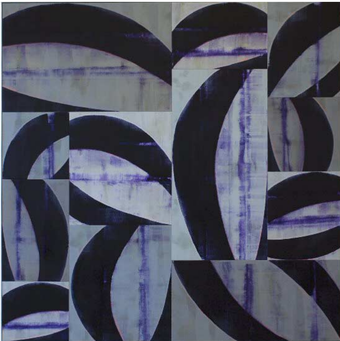
Anecdotes, 2007 acrylic on canvas 96 x 96 inches CA0035