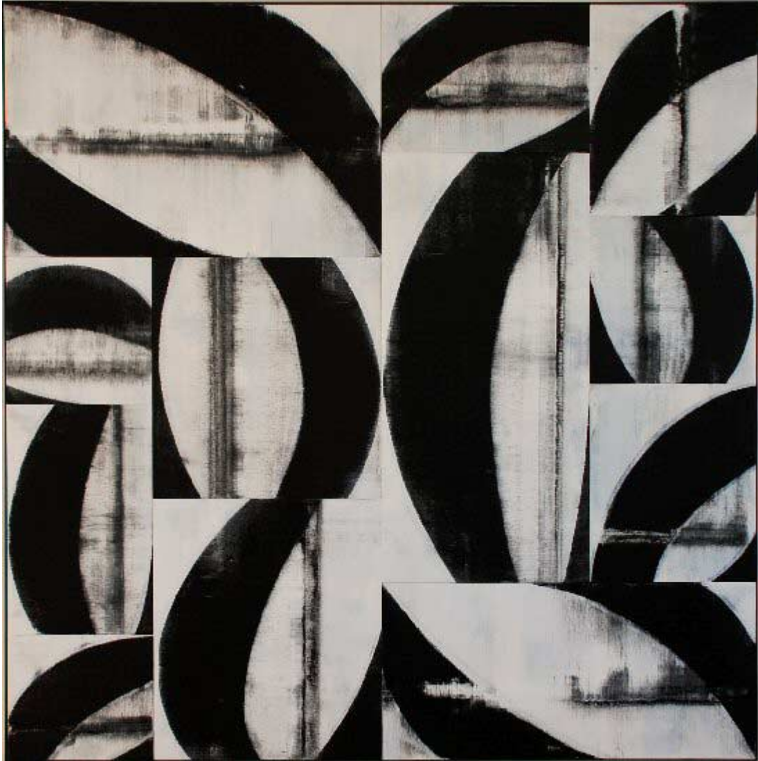
Backbone, 2007 acrylic on canvas 72 x 72 inches CA0037