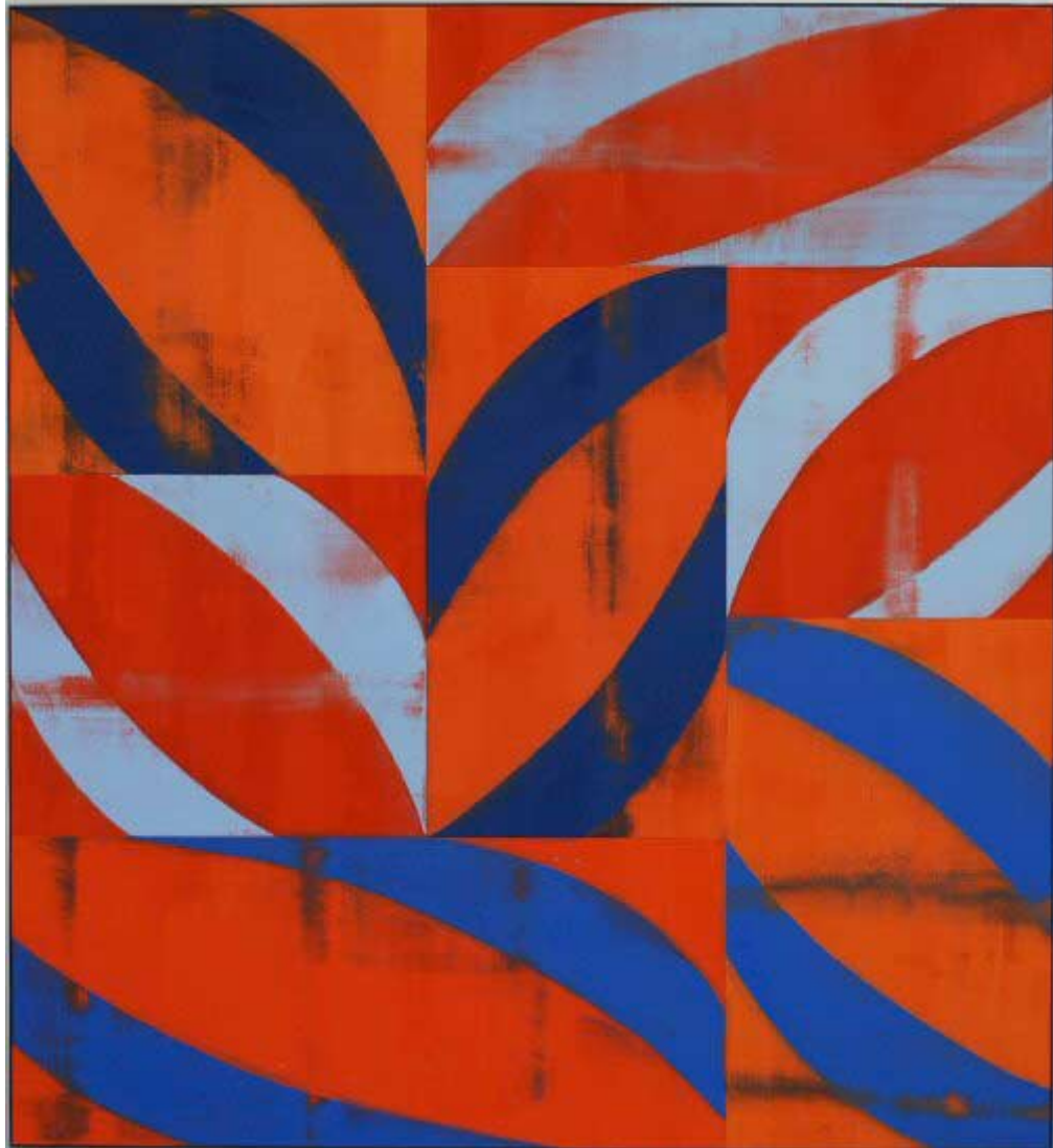
Marks, 2007 acrylic on canvas 88 3/4" x 80 3/4" (framed) CA0033