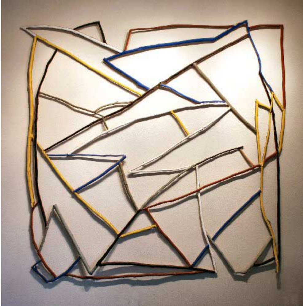
Untitled, 1972 Painted wood construction 72 x 72 inches CA-OK001