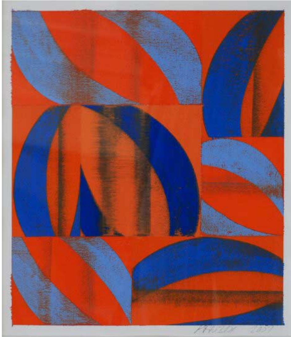
Untitled, 2007 guache on paper 19 x 1 inches CA0044