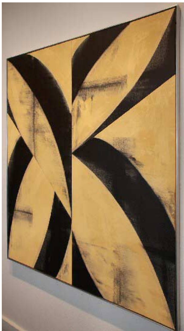
Mission, 2008 Acrylic on canvas 56" x 48" CA0061