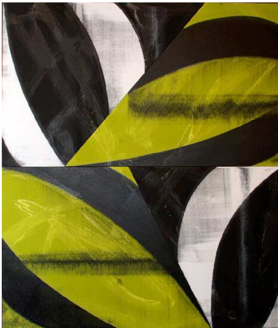
N.S.E.W., 2008 Acrylic on canvas 60" x 51" CA0057