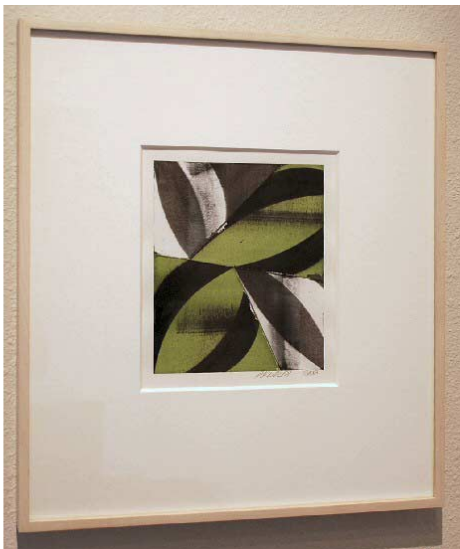
Untitled, 2008 Gouache on paper 17.5" x 17.25" (framed) 7" x 7.25" (image size) CA0064