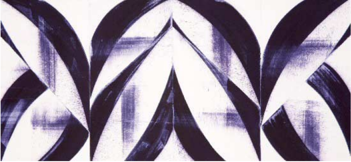
Untitled, 2008 gouache on paper 9" x 19" (image size) 20 x 29 1/4 inches (framed) CA0065