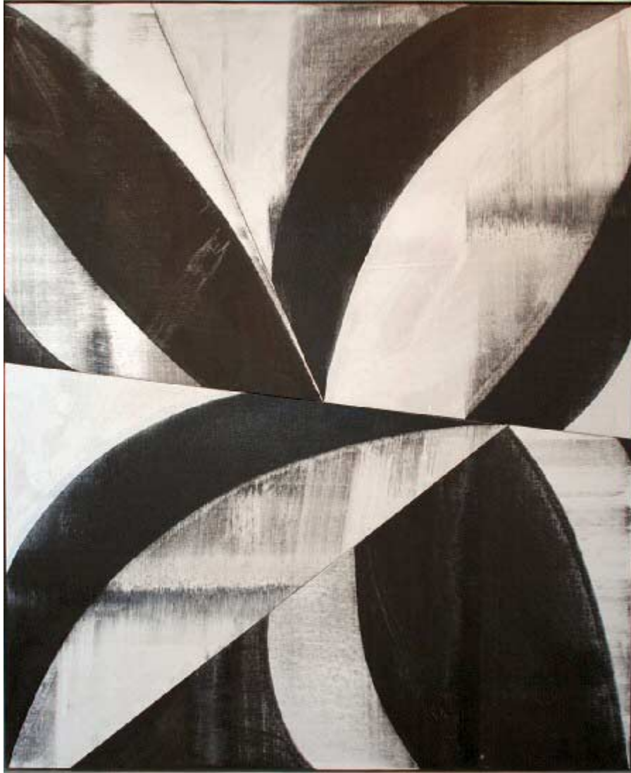
Double Diamond, 2008 Acrylic on canvas 60.75" x 51.75" CA0062