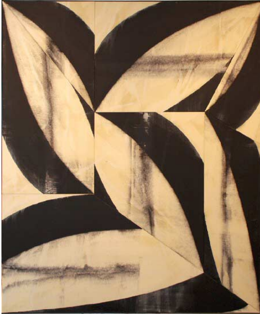
Stalker , 2008 Acrylic on canvas 72" x 60" CA058