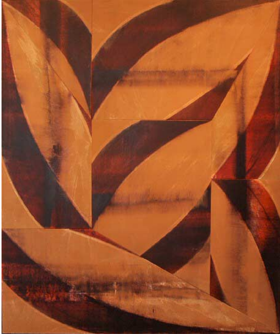
Fight, 2008 Acrylic on canvas 72.75" x 60.75" CA0059