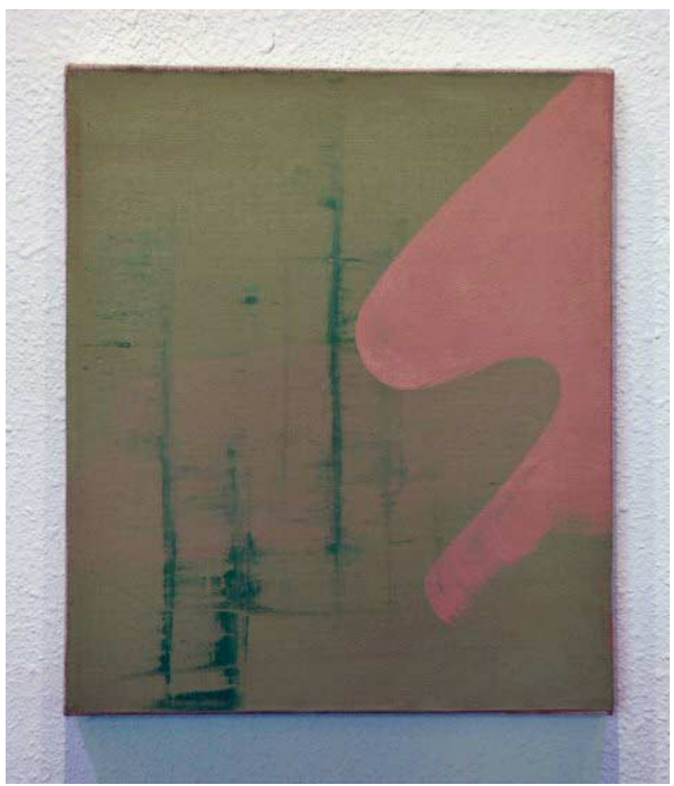
MICHAEL VOSS Copa, 2005 Oil, wax on linen, 14" x 12", MV005