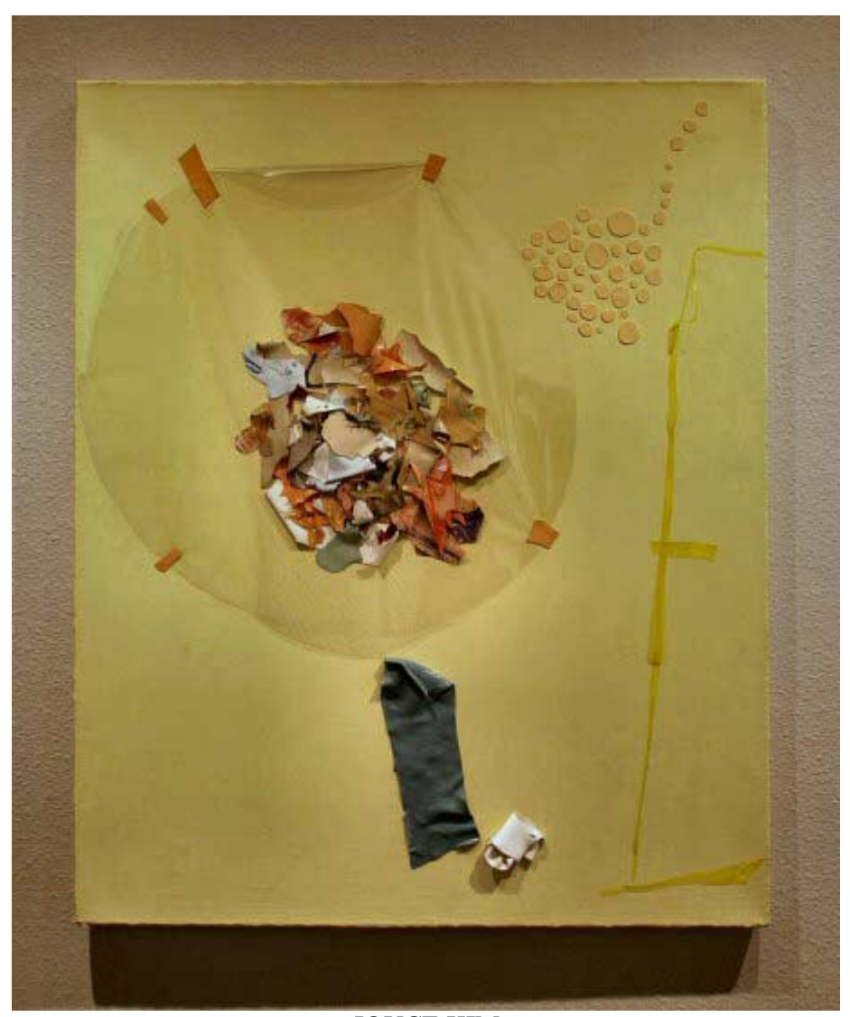
JOYCE KIM Dole, 2003 Mixed media on canvas, 36" x 30", JK001