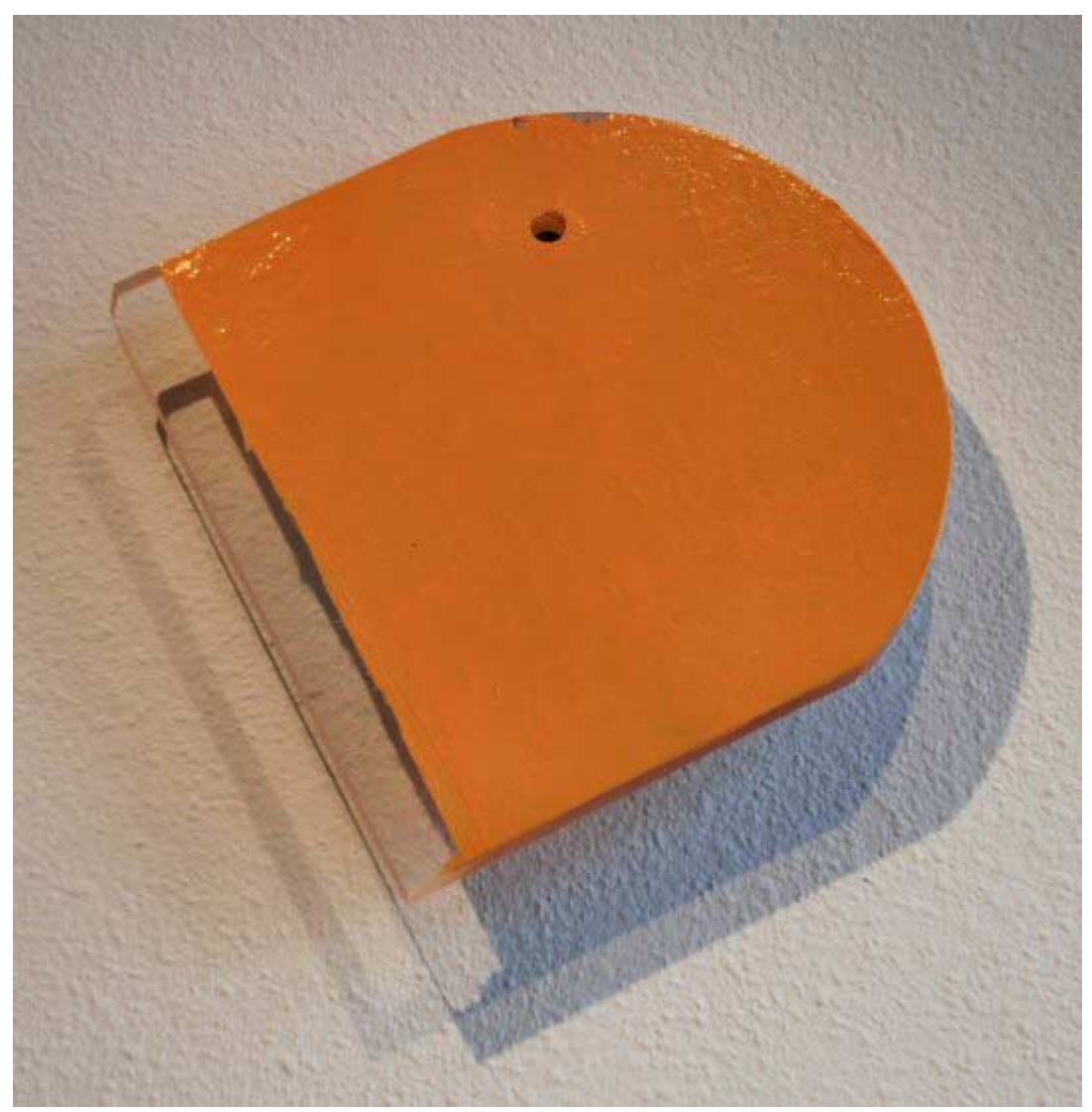
JOHN BEECH Rotating Painting #177, 2005 Enamel, plexiglass, rotating hardware, JB0062