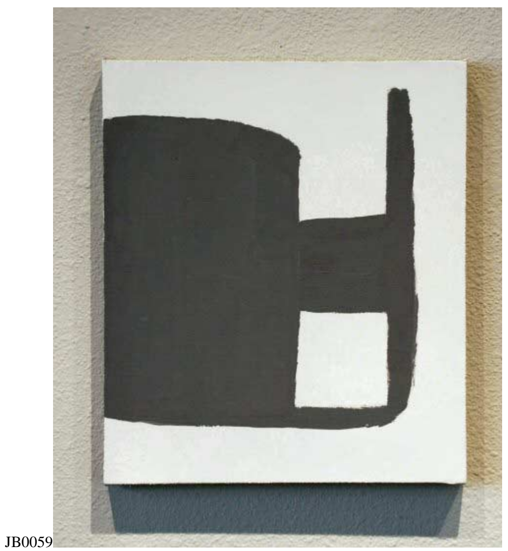
MICHAEL VOSS Untitled (gray shape on pearl white), 2006 Oil, wax on acrylic on linen, 15" x 13", MV004