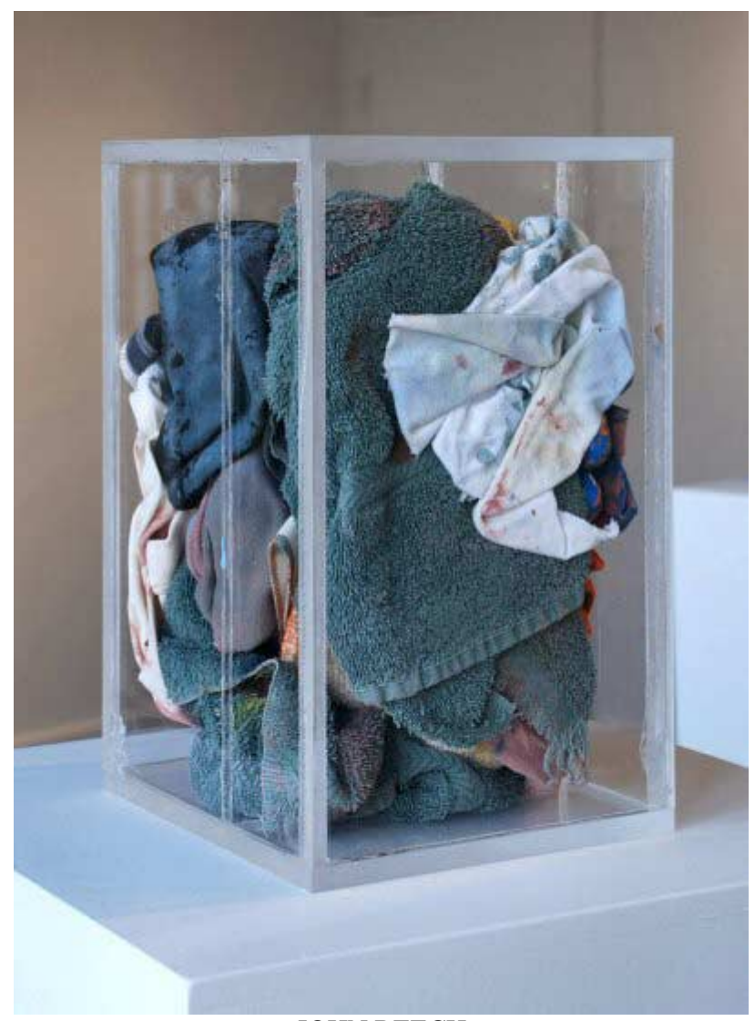
JOHN BEECH Rag Case #3, 2007 Enamel, rags, Plexiglass, JB0061