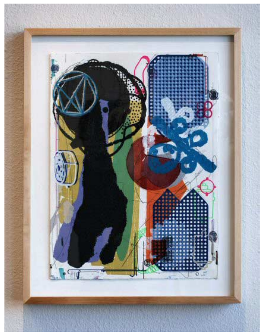
CHRISTOPHER LESNEWSKI Untitled #5, 2006 Mixed media (painting, drawing, print), 14 ½" x 18 ¼", CL005