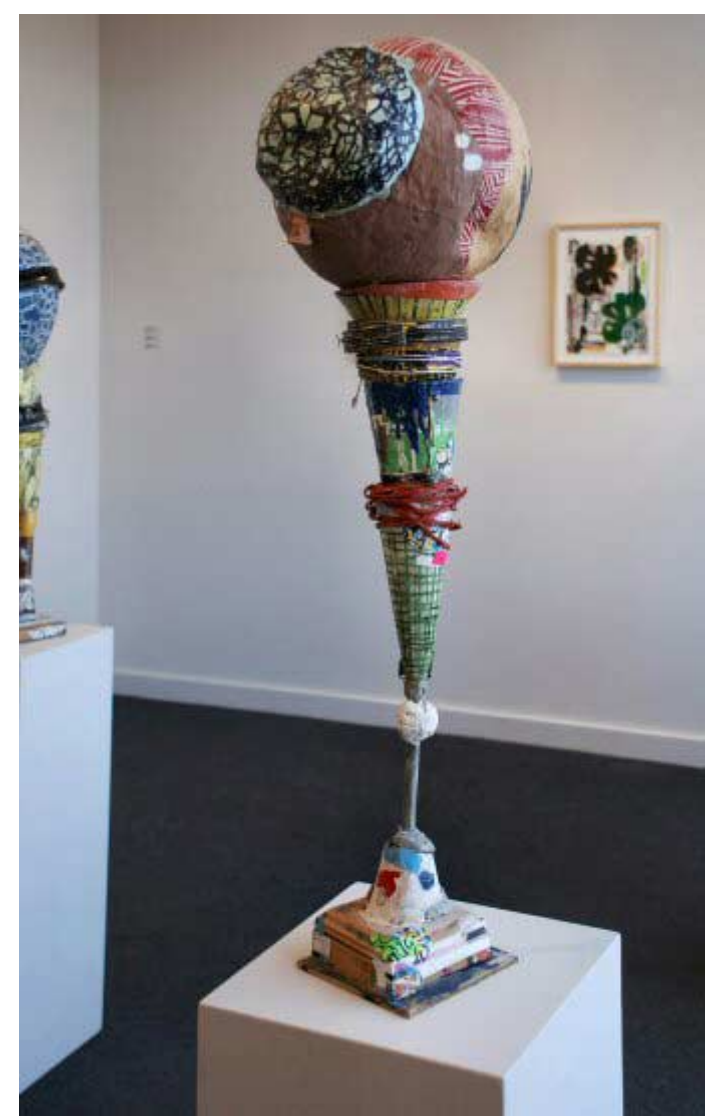
CHRISTOPHER LESNEWSKI Kit, 2005 Mixed media (sculpture), 33" x 11" x 12", CL009