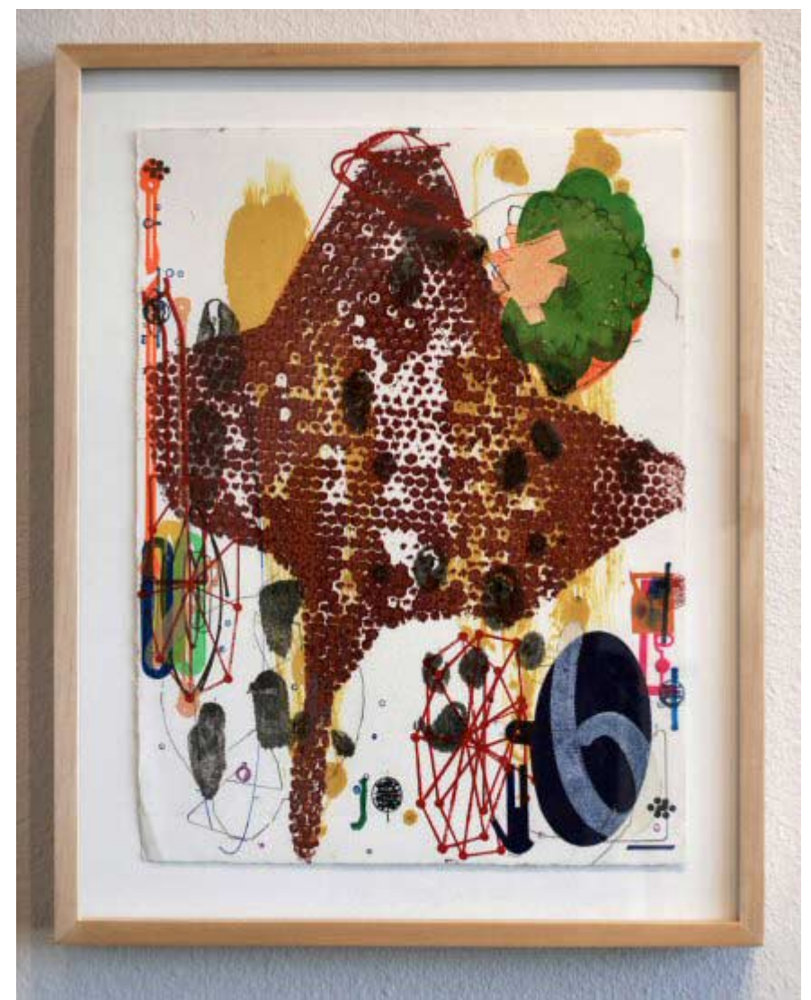
CHRISTOPHER LESNEWSKI Untitled #6, 2006 Mixed media (painting, drawing, print), 14 <sup>1</sup>/<sub>2</sub>" x 18 <sup>1</sup>/<sub>4</sub>", CL006