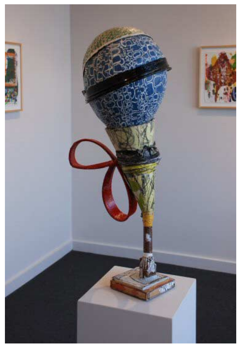
CHRISTOPHER LESNEWSKI 8 mm, 2005 Mixed media (sculpture), 33" x 14" x 12", CL008