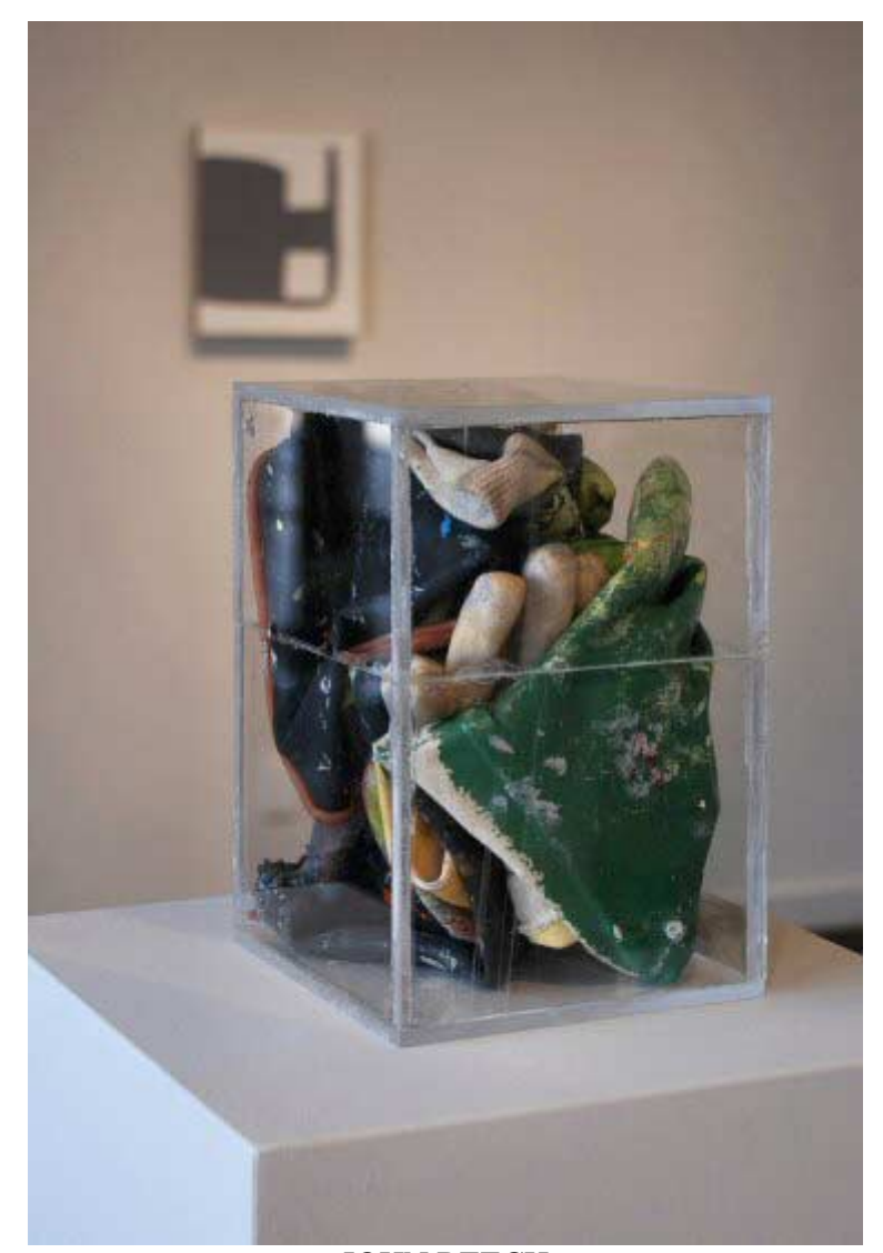
JOHN BEECH Glove Case #2, 2007 Gloves, enamel, Plexiglass, JB0064