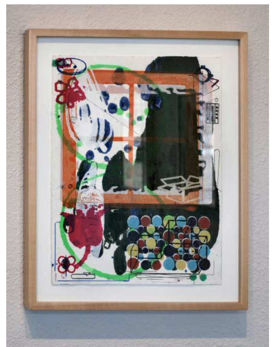
CHRISTOPHER LESNEWSKI Untitled #3, 2006 Mixed media (painting, drawing, print), 14 <sup>1</sup>/<sub>2</sub>" x 18 <sup>1</sup>/<sub>4</sub>", CL003