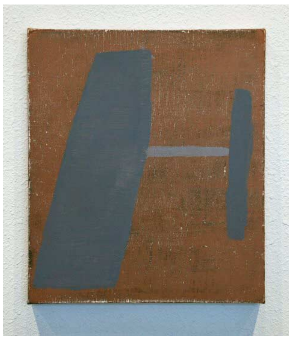
MICHAEL VOSS Untitled (grey on brown), 2006 Oil, wax on linen, 15" x 13", MV002