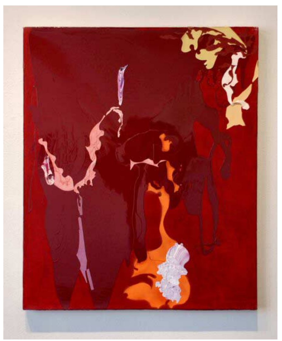
JOYCE KIM Untitled, 2002 Mixed media on canvas, 36" x 30", JK002