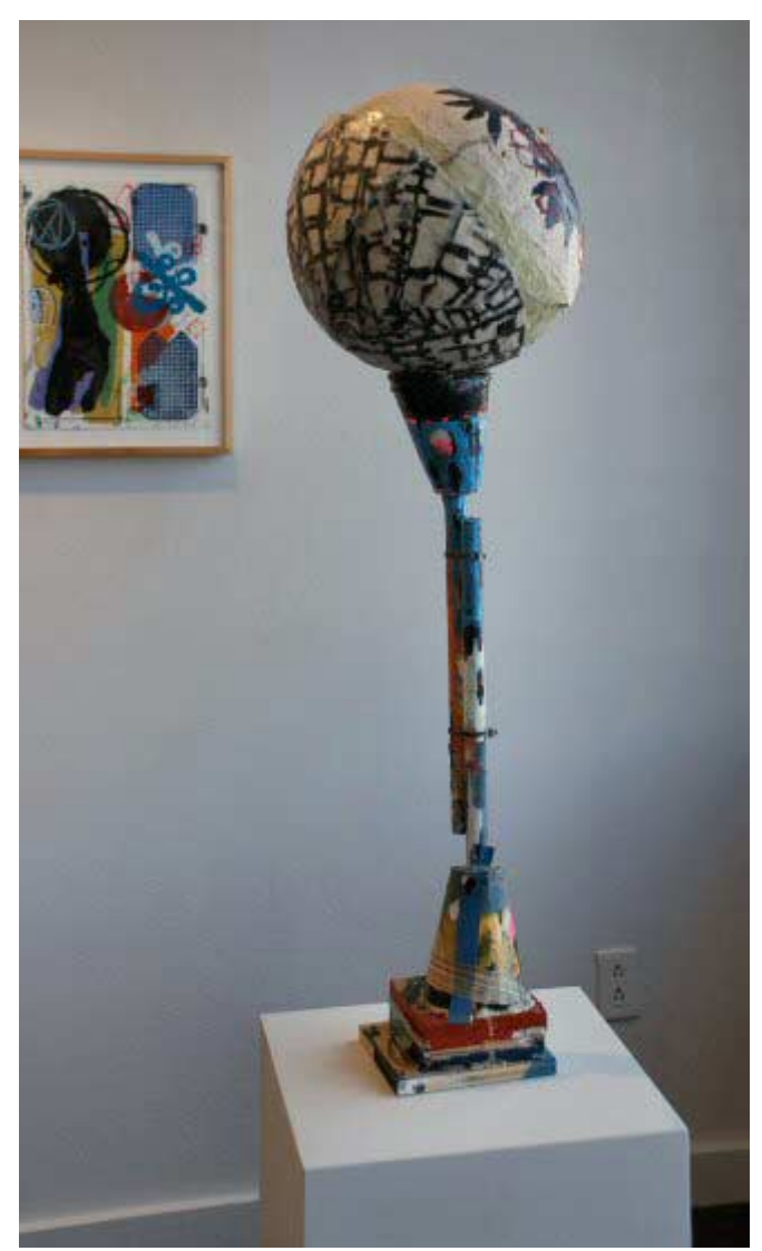
CHRISTOPHER LESNEWSKI The Coil Method, 2004 Mixed media (sculpture), 34" x 12" x 12", CL007