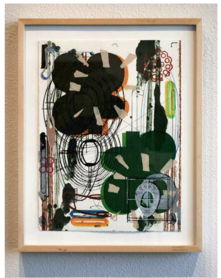
CHRISTOPHER LESNEWSKI Untitled #4, 2006 Mixed media (painting, drawing, print), 14 <sup>1</sup>/<sub>2</sub>" x 18 <sup>1</sup>/<sub>4</sub>", CL004