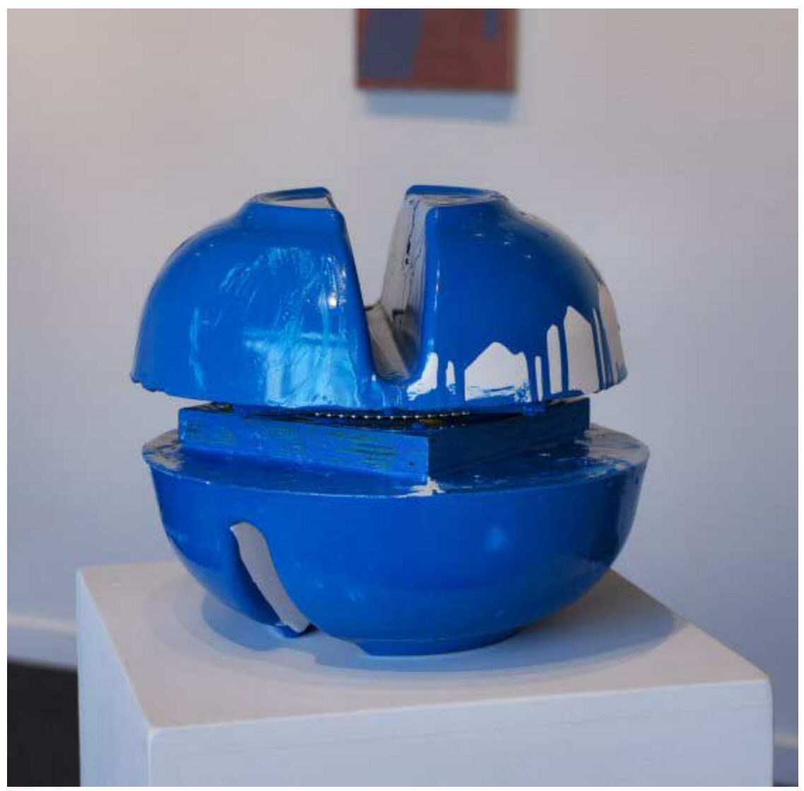
JOHN BEECH Turning Object #44, 2006 Plaster, enamel, plywood, rotating hardware, JB0060