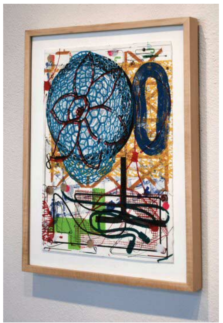
CHRISTOPHER LESNEWSKI Untitled #1, 2006 Mixed media (painting, drawing, print), 14 <sup>1</sup>/<sub>2</sub>" x 18 <sup>1</sup>/<sub>4</sub>", CL001