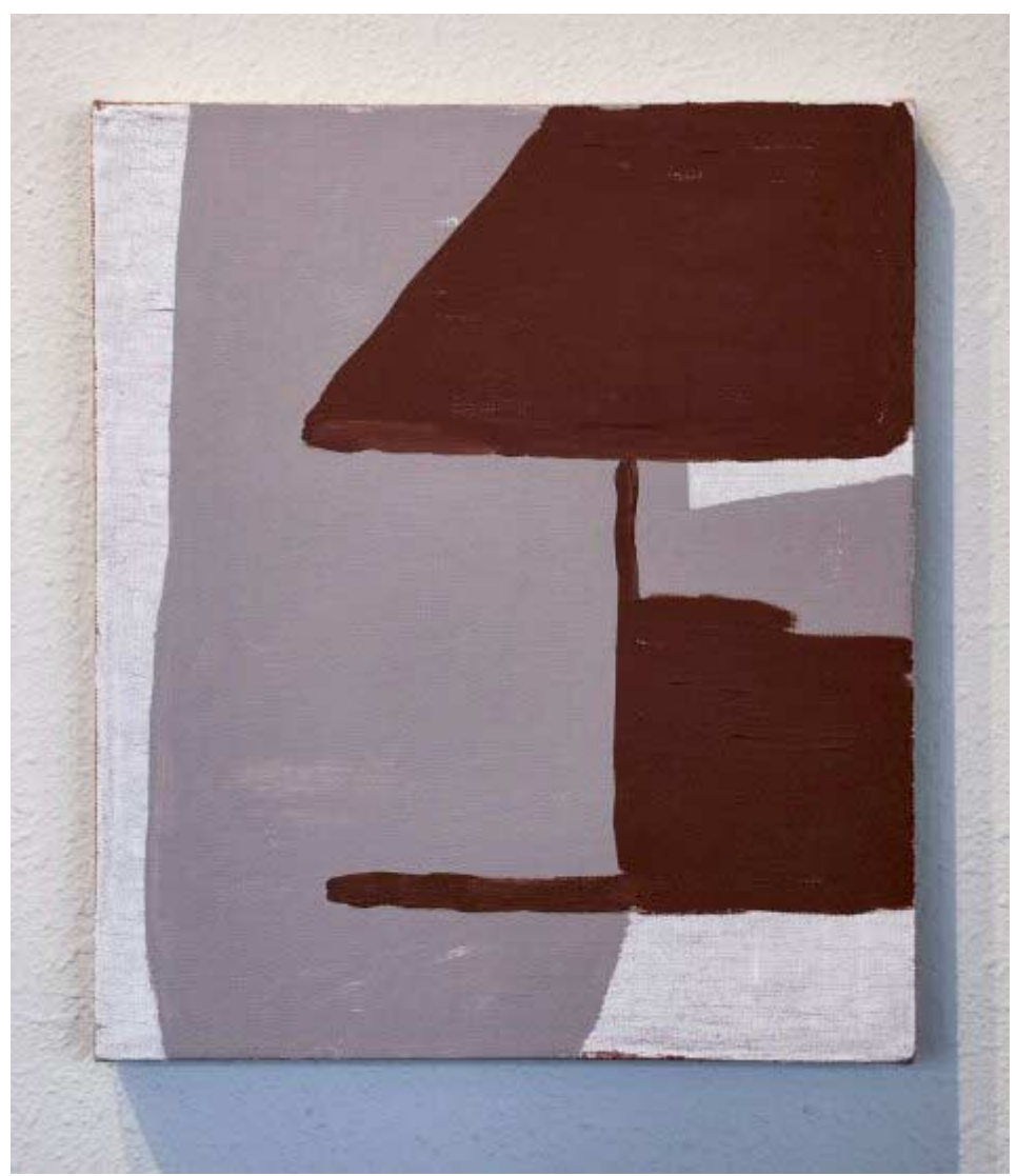
MICHAEL VOSS Untitled (brown on gray on white), 2006 Oil, wax on linen, 14" x 12", MV006