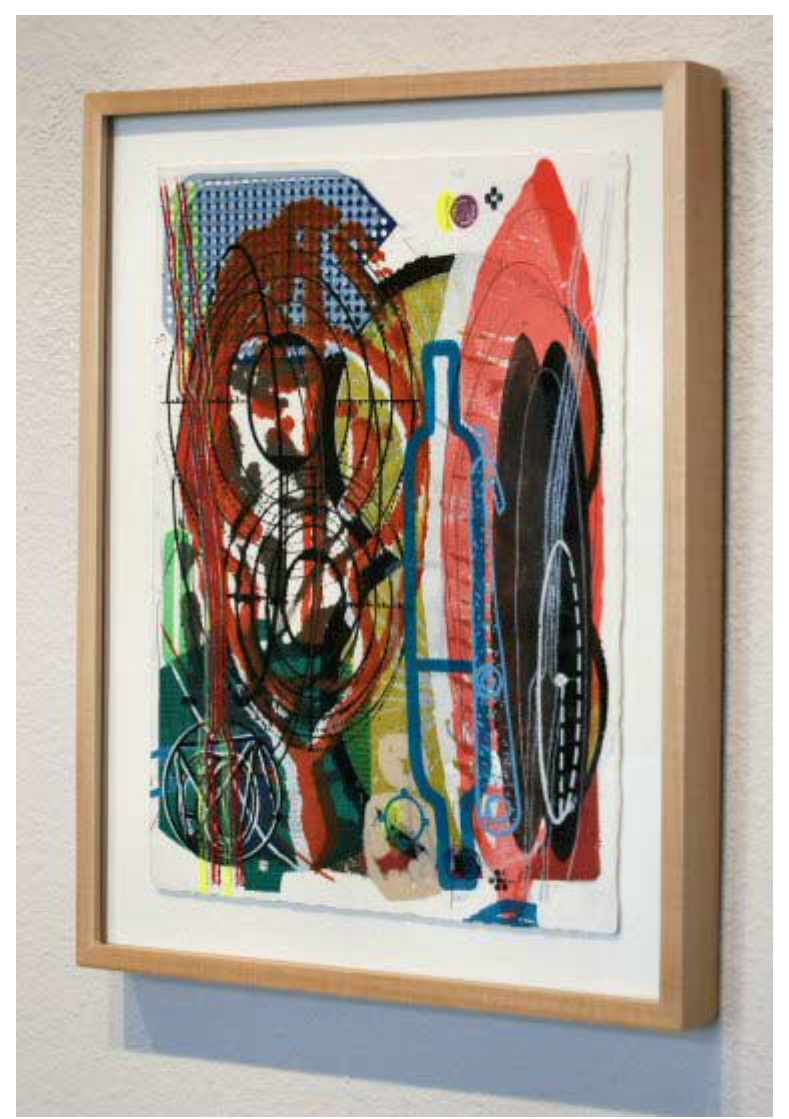
CHRISTOPHER LESNEWSKI Untitled #2, 2006 Mixed media (painting, drawing, print), 14 <sup>1</sup>/<sub>2</sub>" x 18 <sup>1</sup>/<sub>4</sub>", CL002